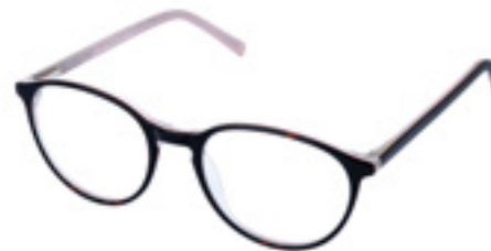
Tort & Pink