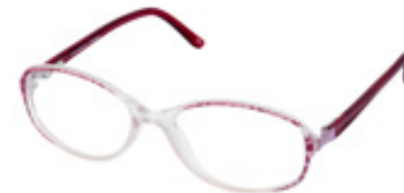
Pink & Crystal