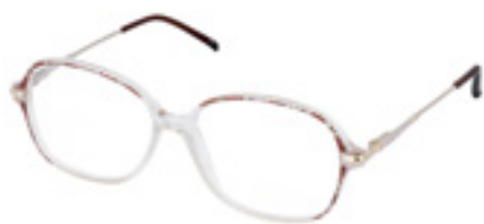
Brown & Crystal