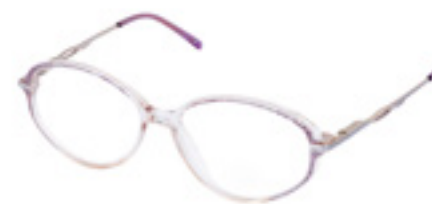
Purple & Crystal