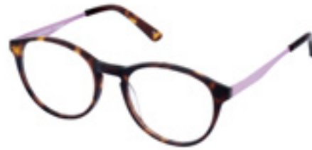
Brown & Lilac