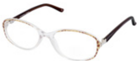
Brown & Crystal