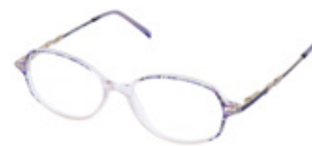
Violet & Crystal