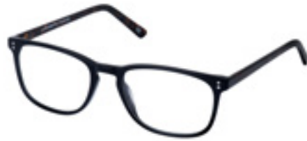
Black & Amber