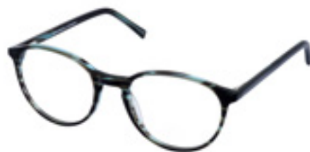
Brown & Blue