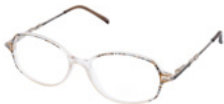
Granite & Crystal