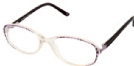
Lavender & Crystal