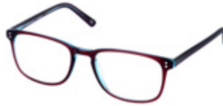
Claret & Blue