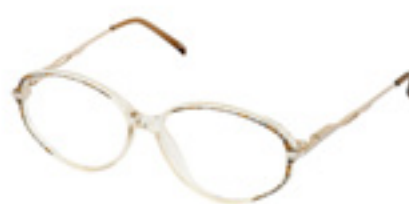
Granite & Crystal