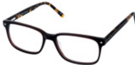
Black & Tort