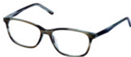
Brown & Blue