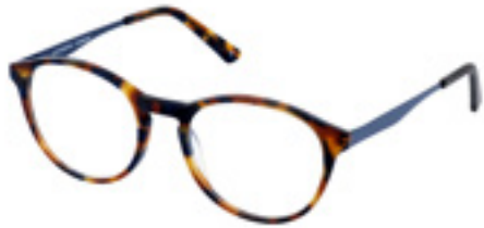
Tort & Blue