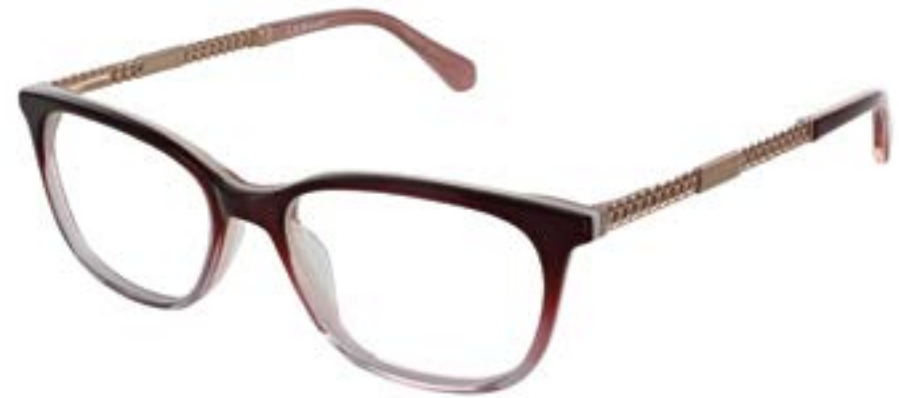
C2 BURGUNDY & GOLD

Eye size: 50mm Bridge: 16mm Temple: 140mm