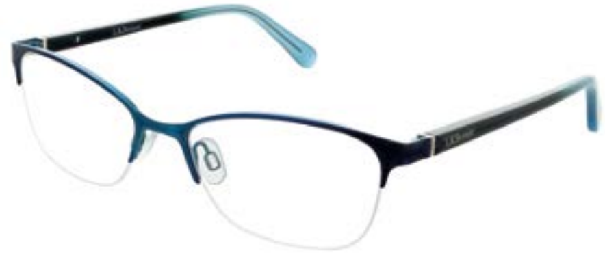
C1 BLUE & TURQUOISE

Eye size: 51mm Bridge: 17mm Temple: 138mm