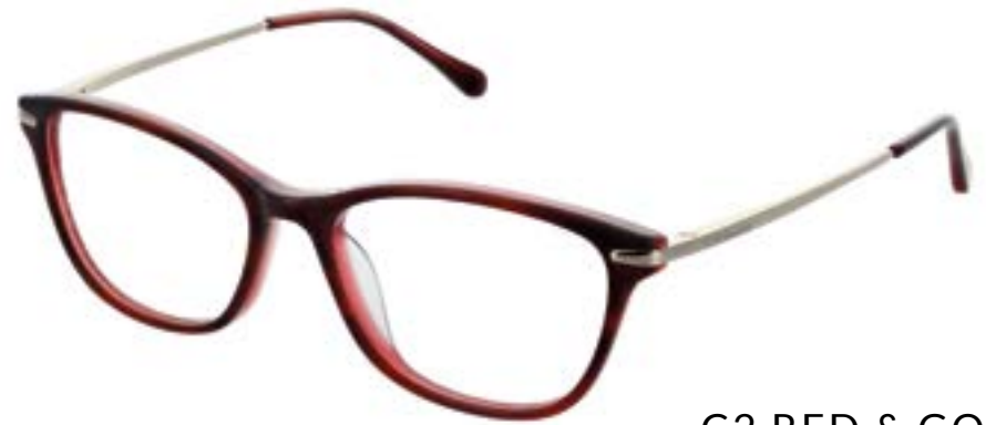
C2 RED & GOLD

Eye size: 52mm Bridge: 16mm Temple: 140mm