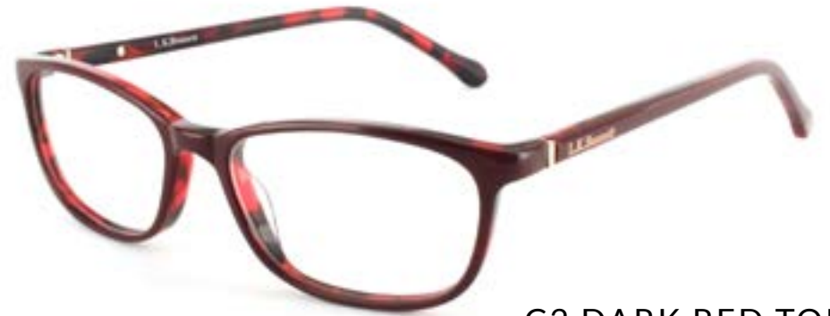
C2 DARK RED TORT

Eye size: 49mm Bridge: 16mm Temple: 135mm