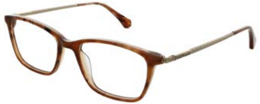
C2 BROWN & GOLD

Eye size: 49mm Bridge: 16mm Temple: 135mm