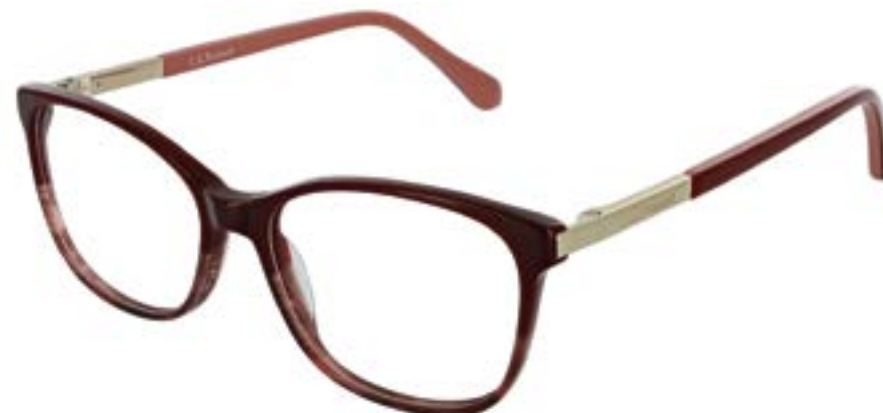
C2 BURGUNDY & PINK