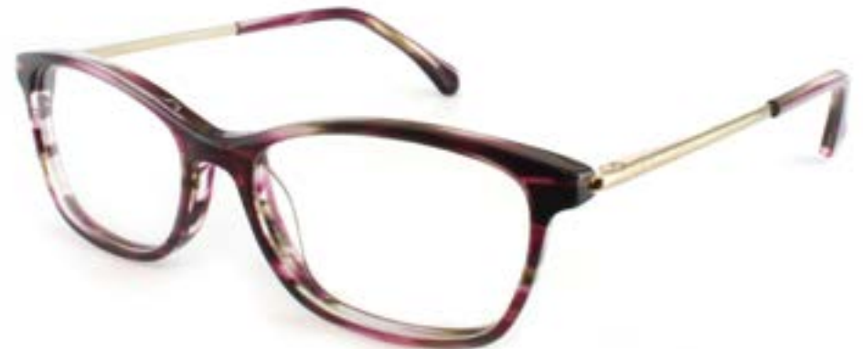
C4 PURPLE TORT & GOLD