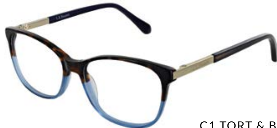
C1 TORT & BLUE

Eye size: 51mm Bridge: 15mm Temple: 135mm