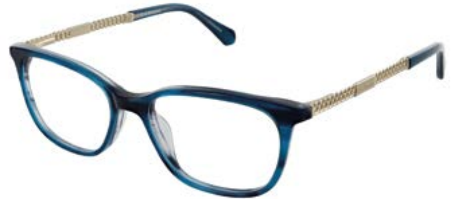
C3 TEAL & GOLD