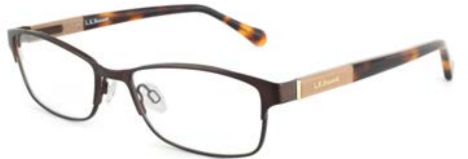
C4 BROWN & NUDE