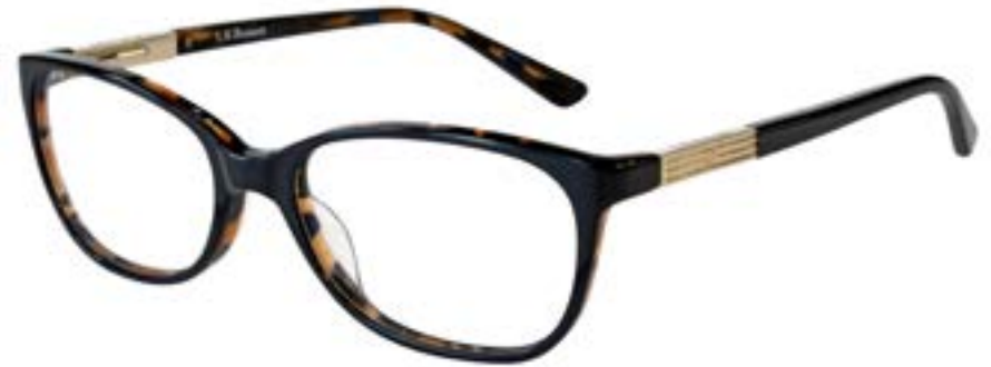
C2 BLUE & TORT