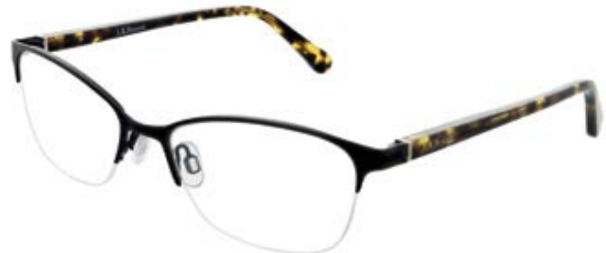
C4 BLACK & TORT