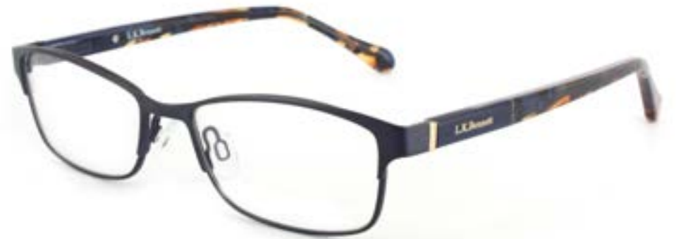
C3 NAVY & TORT