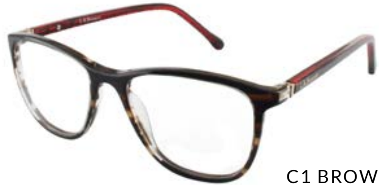
C1 BROWN TORT

Eye size: 50mm Bridge: 16mm Temple: 135mm