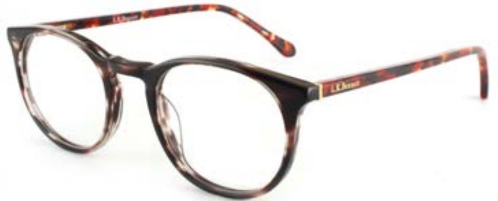
C1 BROWN & RED TORT