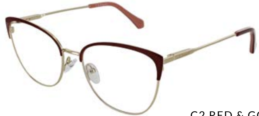
C2 RED & GOLD