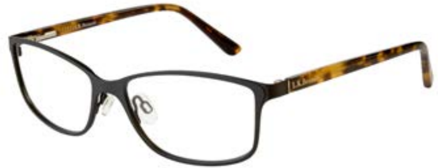
C1 BLACK & TORT

Eye size: 53mm Bridge: 15mm Temple: 135mm