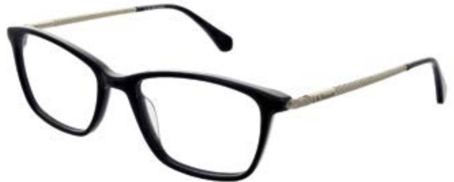
C4 BLACK & GOLD