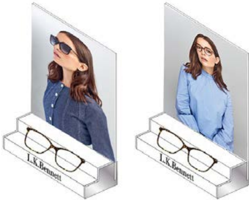
2 Piece Stand: W21.5cm x H6cm x D10cm LKBSTAKIT1