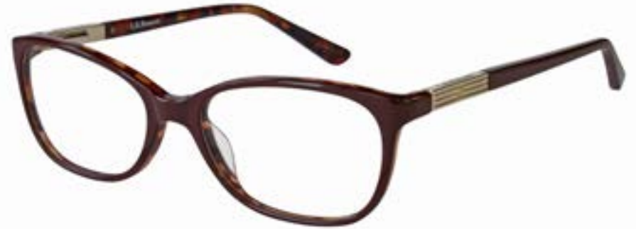
C1 RED & TORT