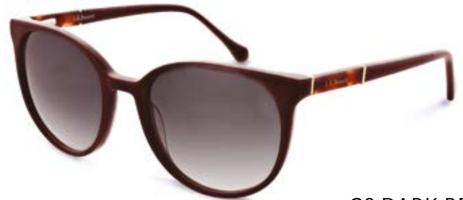
C3 DARK RED