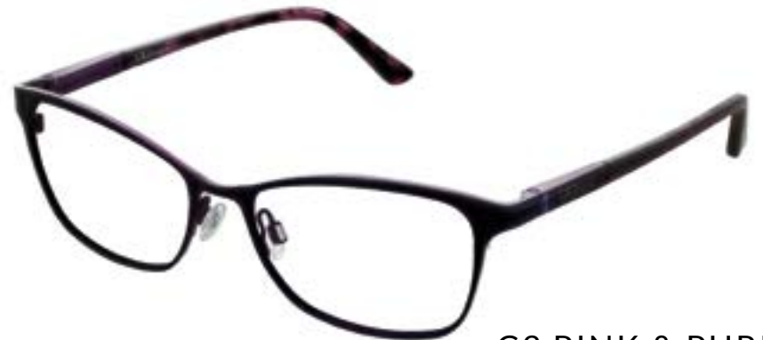
C3 PINK & PURPLE