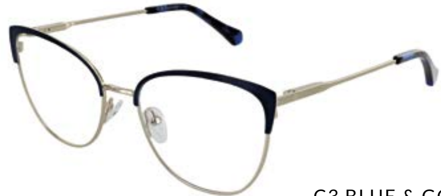
C3 BLUE & GOLD