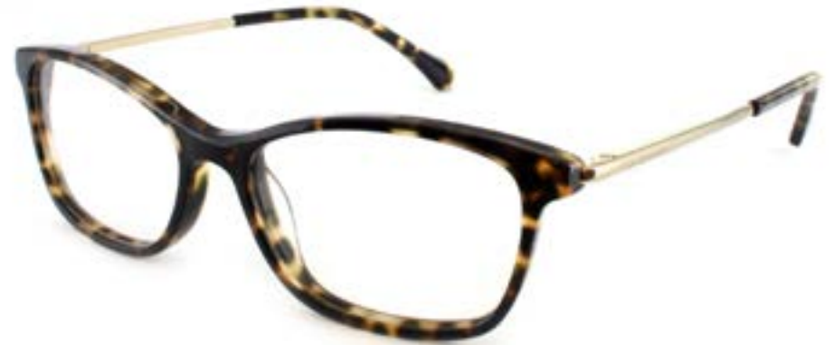
C3 BROWN TORT & GOLD