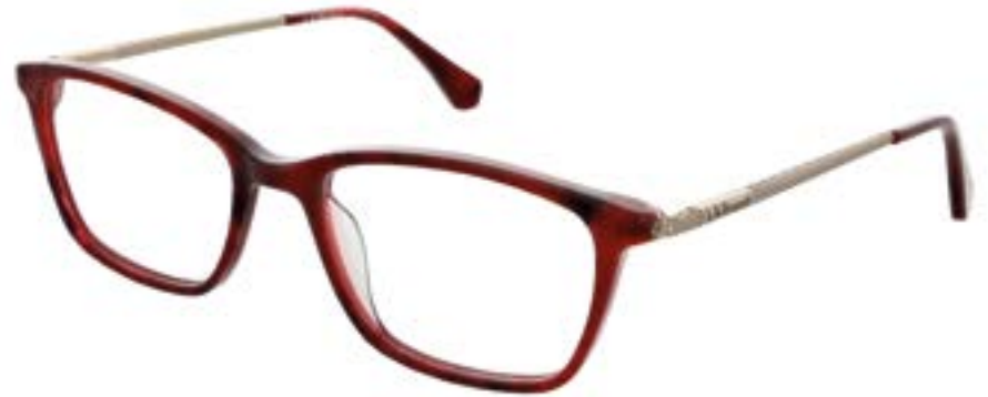
C3 RED & GOLD