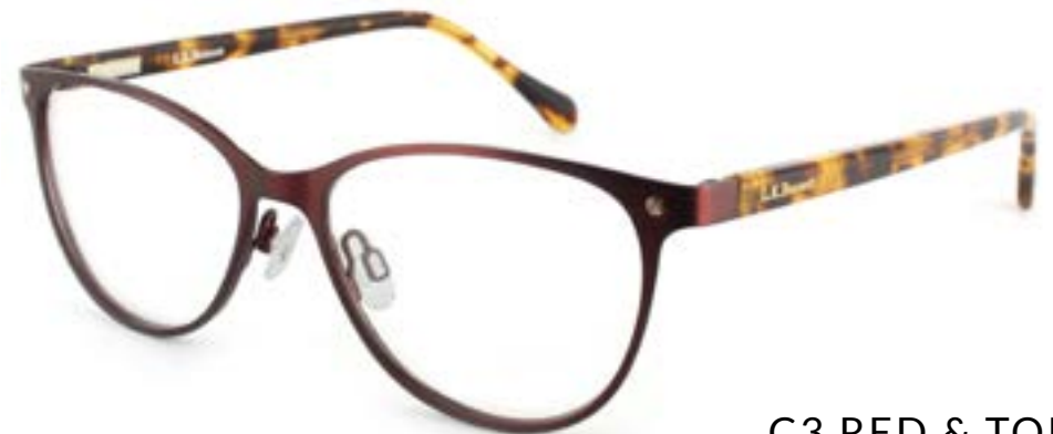
C3 RED & TORT