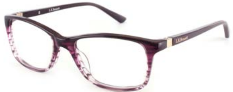
C3 PURPLE GRAD