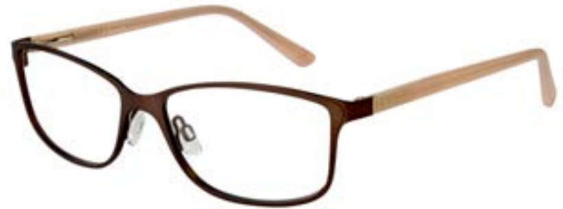
C2 BROWN & NUDE