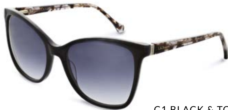
C1 BLACK & TORT