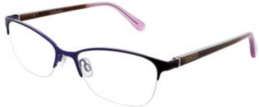
C3 PURPLE & PINK