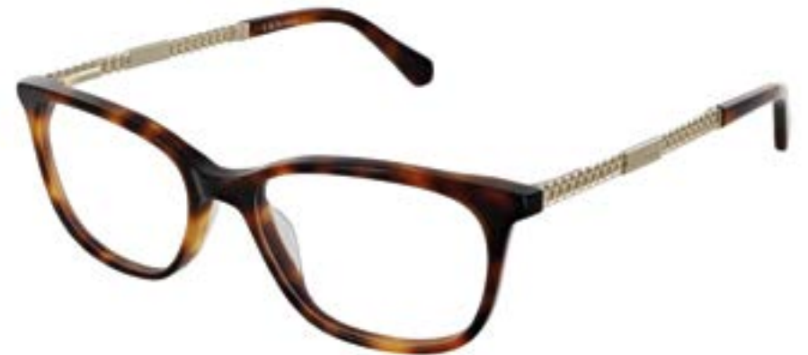
C4 TORT & GOLD