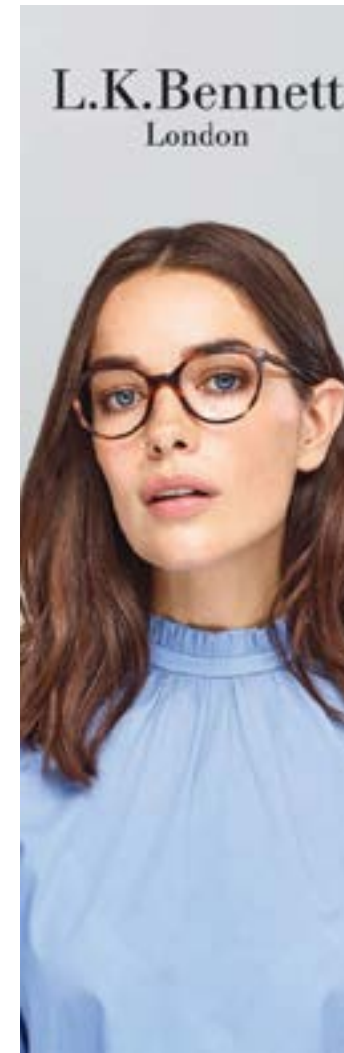
Optical Banner: W50cm x H150cm LKBBAN02