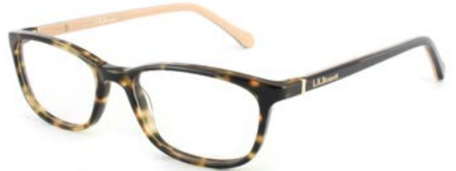
C3 TORT & BROWN