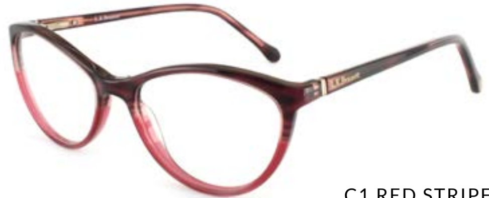
C1 RED STRIPE

Eye size: 53mm Bridge: 17mm Temple: 135mm