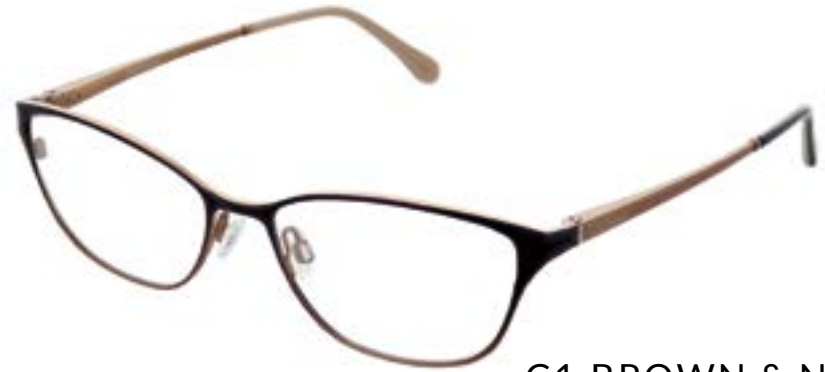
C1 BROWN & NUDE

Eye size: 52mm Bridge: 16mm Temple: 138mm