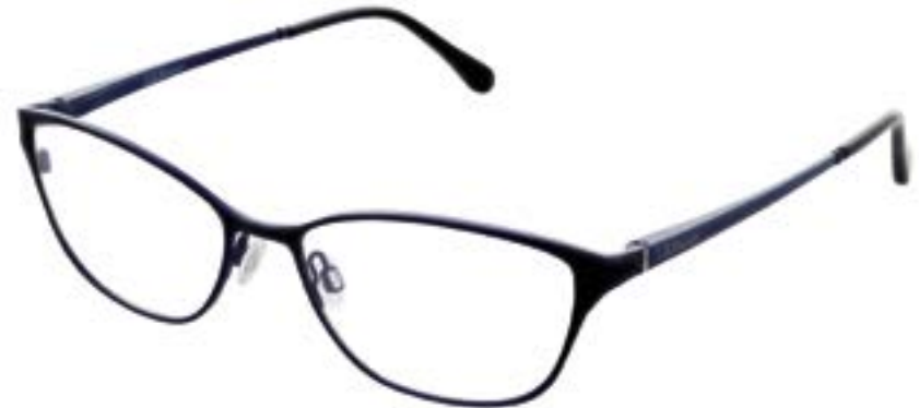
C2 BLACK & BLUE