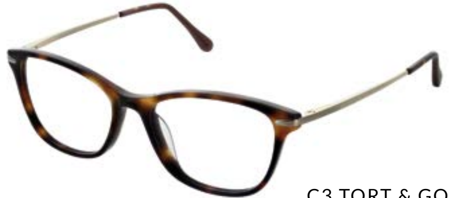
C3 TORT & GOLD