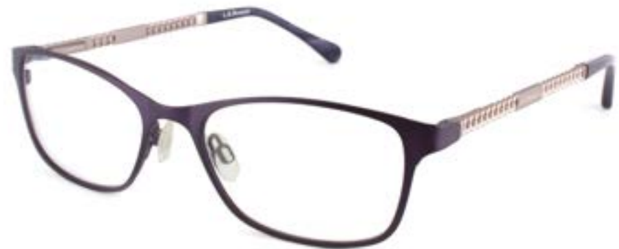
C3 PURPLE & GOLD