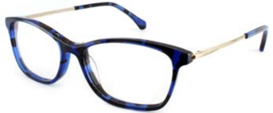
C2 BLUE TORT & GOLD

Eye size: 51mm Bridge: 15mm Temple: 140mm