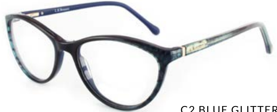
C2 BLUE GLITTER