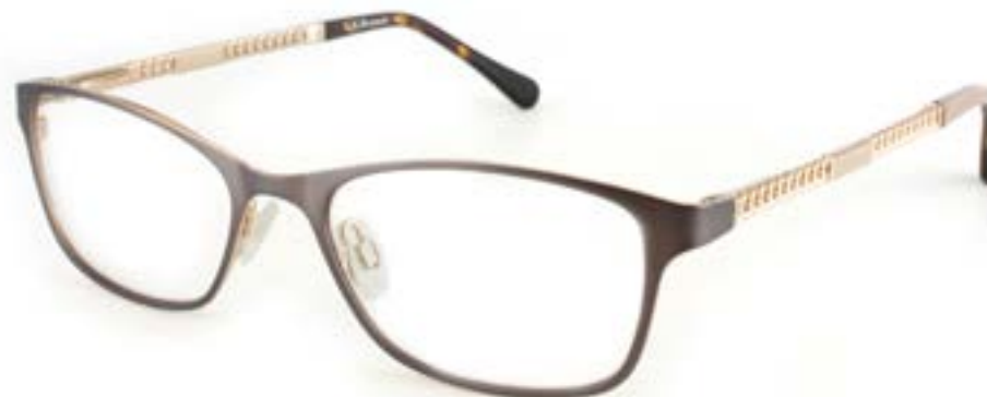
C2 GREY & GOLD