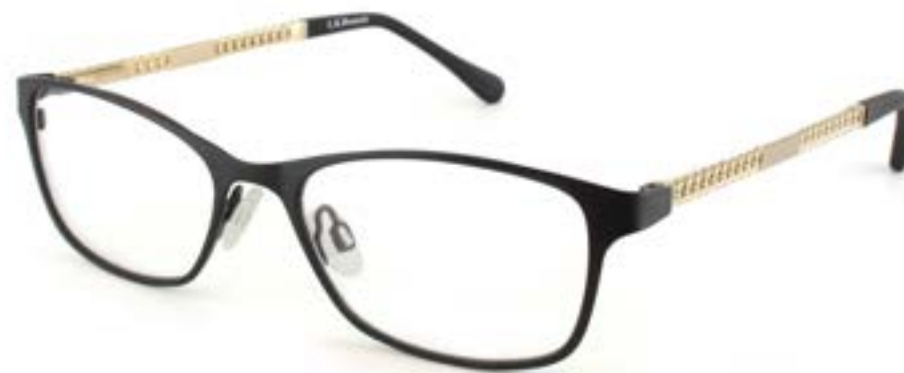
C1 BLACK & GOLD

Eye size: 52mm Bridge: 17mm Temple: 135mm