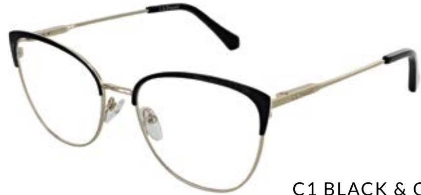
C1 BLACK & GOLD