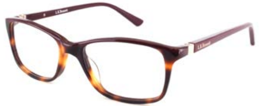
C1 RED TORT

Eye size: 50mm Bridge: 16mm Temple: 135mm