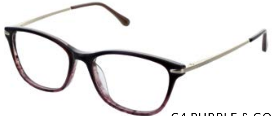
C4 PURPLE & GOLD