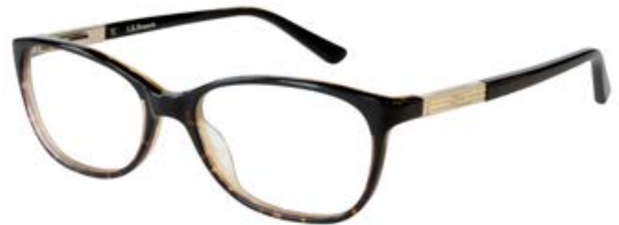
C3 BLACK TORT