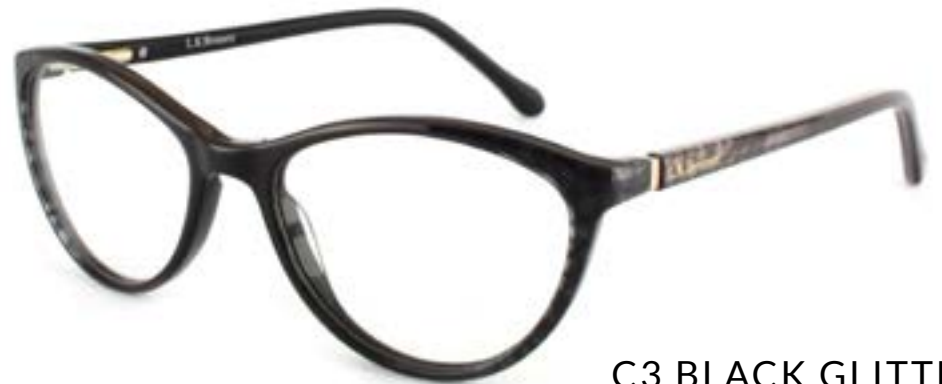
C3 BLACK GLITTER