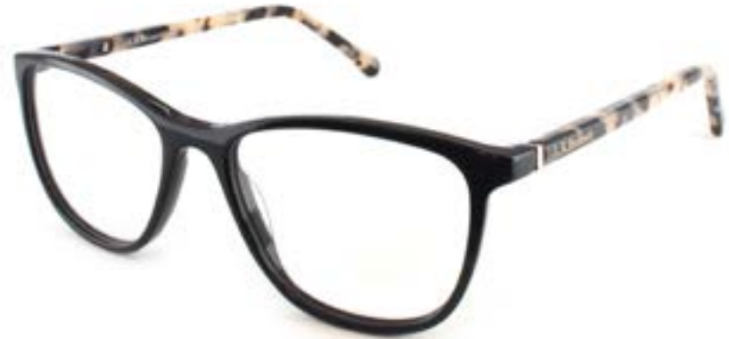
C2 BLACK & BROWN TORT