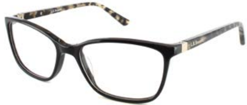
C1 BLACK & TORT