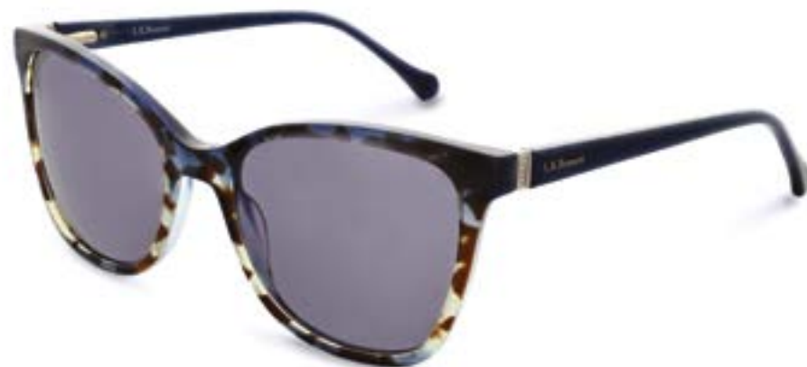
C3 BLUE TORT