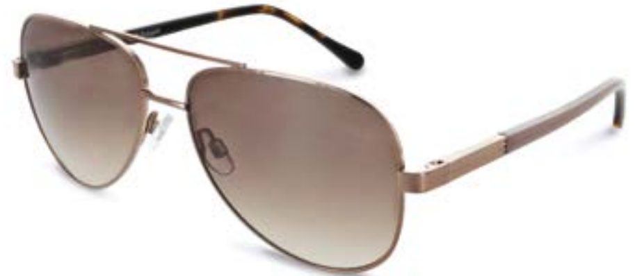
C2 ROSE GOLD