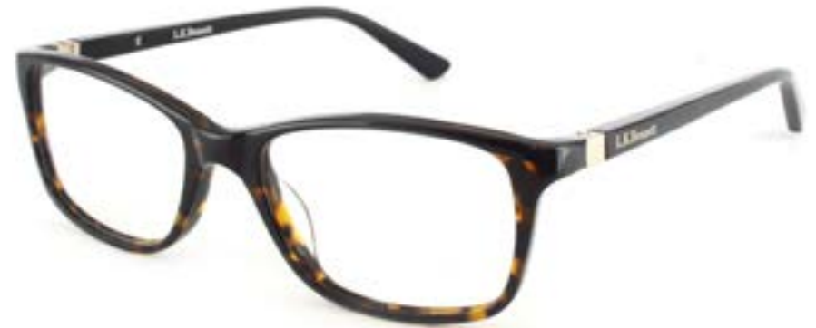
C2 BROWN TORT