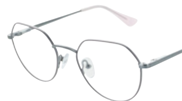
Gun & Lilac