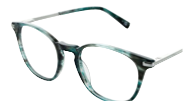
Grey & Silver