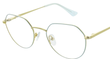
Gold & Blue