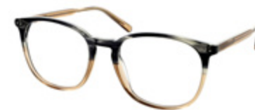
Grey & Sherry