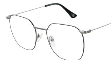
Gold & Dark Grey