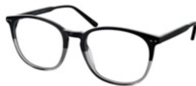
Black & Grey