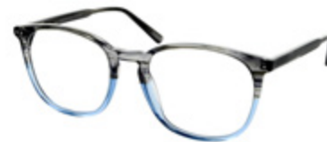
Grey & Blue