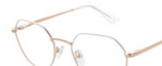
Rose Gold & White