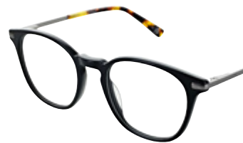
Black & Gun