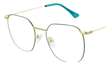
Gold & Dark Green