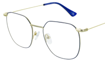
Gold & Dark Blue