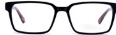
C3 - BLACK SLATE WHBRU3