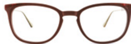
C2 - CRIMSON TORT WHGLA02