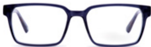
C1 - NAVY HAZE WHBRU1