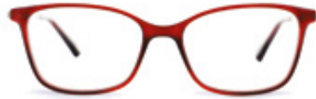
C1 - CRIMSON FLAME WHBLA1