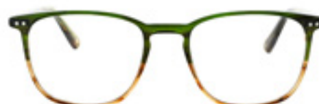
C2 - OLIVE TOPAZ WHDARW03