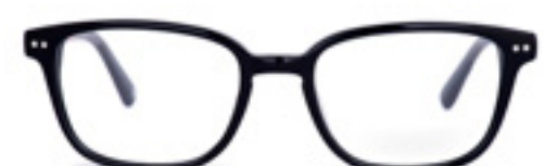
C3 - JET ROUGE WHBRON3