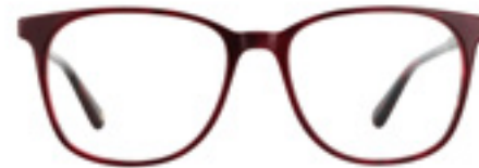
C2 - ENGLISH MULBERRY WHAYR02