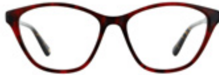
C1 - CRIMSON TORT WHSILO1