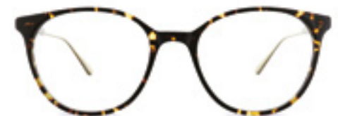
C3 - MIDNIGHT EMBER WHTEA03