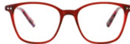
C2 - RASPBERRY WHBELO2