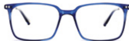
C3 - ROYAL PACIFIC WHDEF3