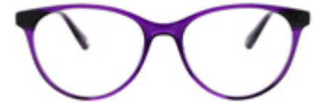
C3 - BERRY BURST WHANNO3