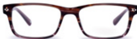
C2 - RUSSET SPRUCE WHKIP2