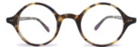
C3 - VEILED SAPPHIRE WHCOW3