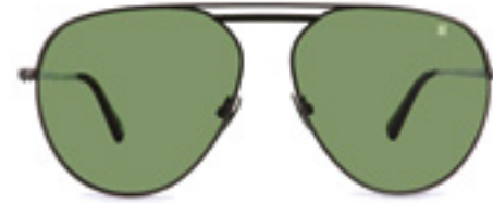
C2 - STORM GREY WHSWALTO2