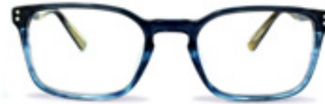
C2 - ARCTIC MIDNIGHT WHLEW2