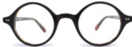
C1 - MIDNIGHT EMBER WHCOW1