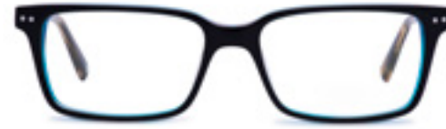
C2 - MIDNIGHT SAPPHIRE WHORW2