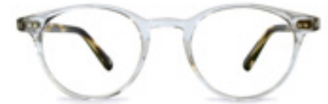
C4 - CRYSTALLINE TORT WHWAL4