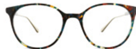
C2 - MARBLED TURQUOISE WHTEA02