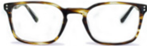
C1 - CHAMPAGNE MARBLEWOOD WHLEW1