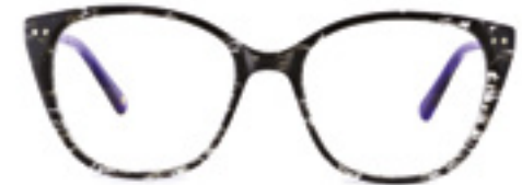
C3 - CHARCOAL SLATE WHSIMO3