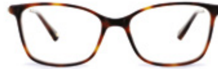
C2 - BURNT CARAMEL WHBLA2