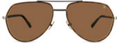
C1 - SEPIA MARBLEWOOD WHSGOLO1