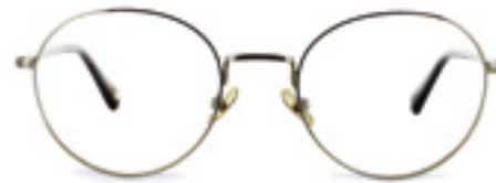
C3 - GOLDEN TORT WHNAS3