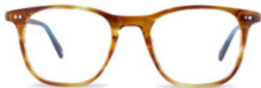
C2 - BLACK SLATE WHELG2