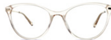
C3 - PINOT BLUSH WHRUT3