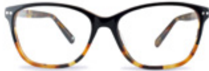
C1 - MIDNIGHT EMBER WHHEPW1