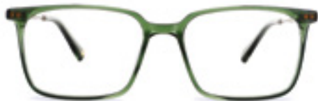
C2 - OLIVE DUSK WHDEF2