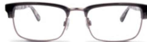
C2 - GREY SMOKE WHLOW2