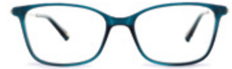
C3 - MIDNIGHT TEAL WHBLA3