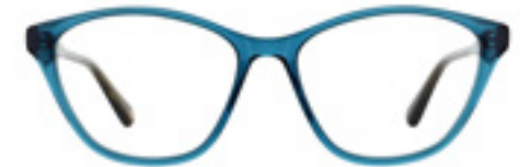
C3 - MIDNIGHT TEAL WHSILO3