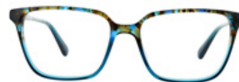
C3 - BURNT EMBER WHDARW03