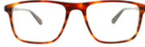
C3 - WALNUT WHMITO2