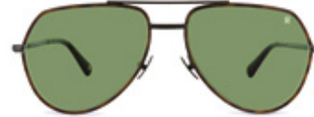
C2 - STORM GREY WHSGOLO2