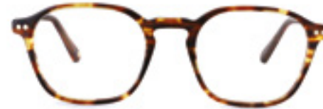
C2 - FLAMING EMBER WHC0002