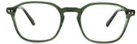
C3 - OLIVE DUSK WHC0003