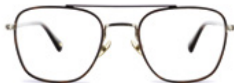
C1 - SEPIA MARBLEWOOD WHHAN1