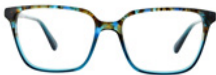
C1 - CRIMSON FLAME WHROS01