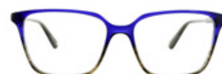
C3 - BERRY BURST WHROS03