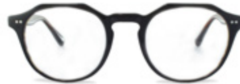
C2 - MIDNIGHT EMBER WHHOG2