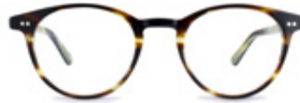
C2 - CHAMPAGNE MARBLEWOOD WHWAL2