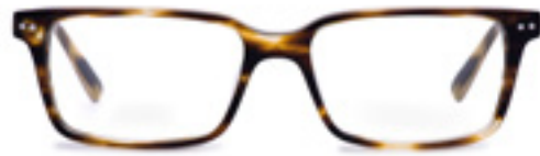
C1 - GOLDEN MARBLEWOOD WHORW1