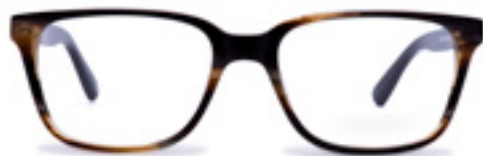
C1 - TUSCAN OAK WHDIC1