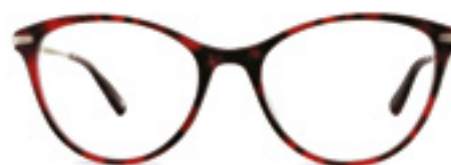
C2 - CRIMSON TORT WHRUT2