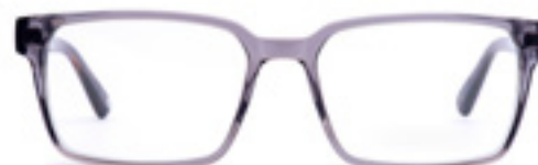
C2 - GREY SMOKE WHBRU2