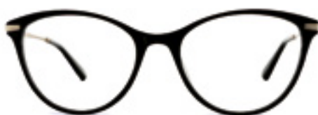
C1 - BLACK SLATE WHRUT1