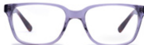
C2 - LAVENDER CRYSTAL WHDIC2