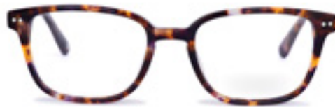
C1 - ELDERBERRY WHISKEY WHBRON1