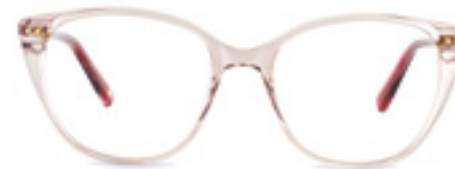
C2 - CRYSTAL ROUGE WHSIMO2