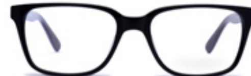
C3 - BLACK SLATE WHDIC3