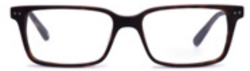
C3 - RUSSET WALNUT WHORW3