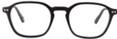
C1 - BLACK SLATE WHC0001