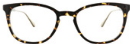
C1 - MIDNIGHT EMBER WHGLA01