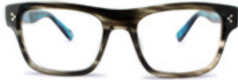
C2 - ARCTIC CRYSTAL WHSTUB2