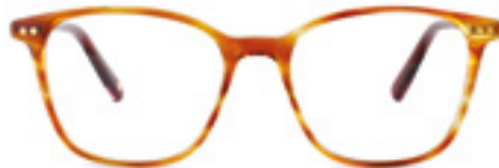
C1 - GOLDEN TOPAZ WHBELO1