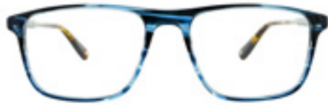
C1 - ARTIC MIDNIGHT WHMITO1