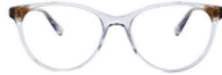
C2 - GREY SMOKE WHANNO2