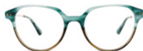
C3 - SEA BREEZE WHDV3