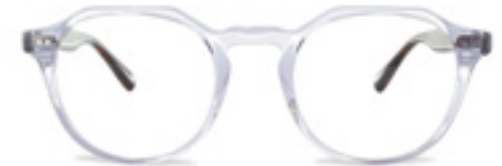
C3 - LAVENDER CRYSTAL WHHOG3