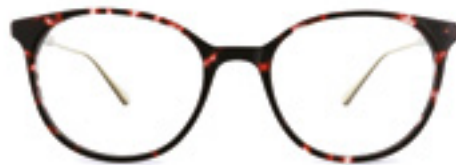
C1 - RUBY TORT WHTEA01