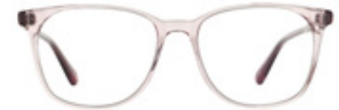
C3 - PINOT BLUSH WHAYR03