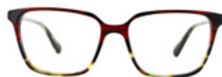
C2 - GREY SMOKE WHROS02