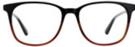
C1 - AUTUMN BLACK WHAYR01