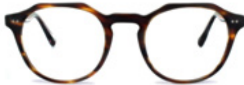
C1 - CHERRY EMBER WHHOG1