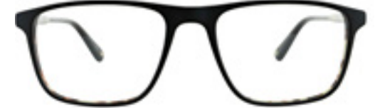
C3 - MIDNIGHT EMBER WHMITO3