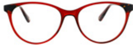
C1 - CRIMSON FLAME WHANNO1