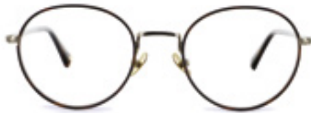
C1 - SEPIA MARBLEWOOD WHNAS1