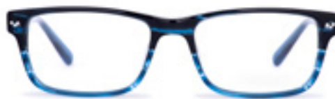
C3 - ARCTIC MIDNIGHT WHBYR3