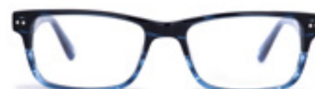
C3 - ARCTIC MIDNIGHT WHKIP3