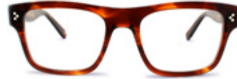
C3 - FLAMING EMBER WHSTUB3