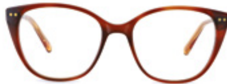
C1 - WALNUT WHSIMO1