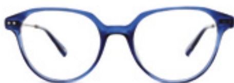
C2 - ROYAL PACIFIC WHDV2