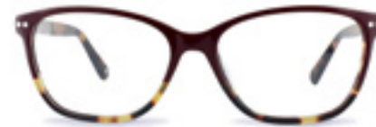
C2 - SCARLET EMBER WHHEPW2