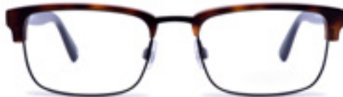
C1 - FLAMING EMBER WHLOW1