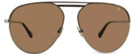
C1 - GOLDEN TORT WHSWALTO1