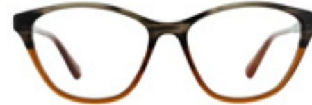
C2 - ROAST CHESTNUT WHSILO2