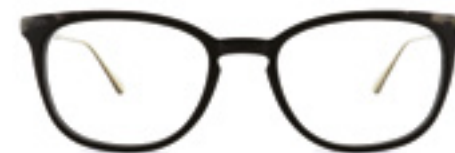
C3 - BLACK SLATE WHGLA03