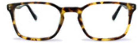
C3 - FLAMING EMBER WHLEW3