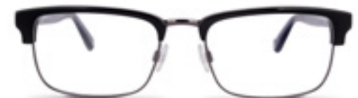
C3 - BRUSHED SLATE WHLOW3