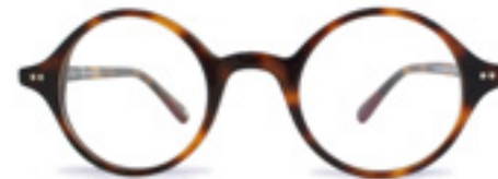
C2 - FLAMING EMBER WHCOW2