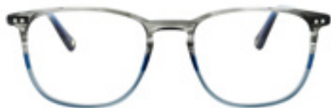
C1 - ARCTIC STORM WHDARW01