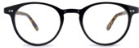
C1 - MIDNIGHT EMBER WHWAL1