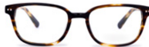
C2 - GOLDEN MARBLEWOOD WHBRON2