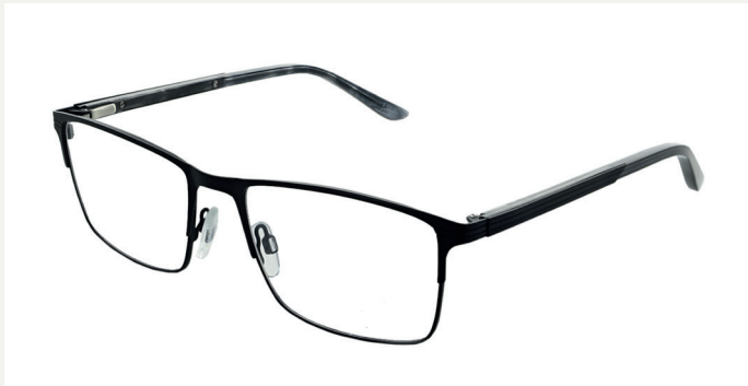
C2. DARK BLUE