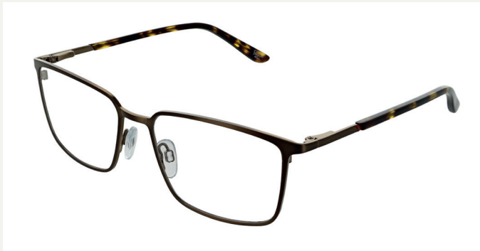
C3. DARK BLUE