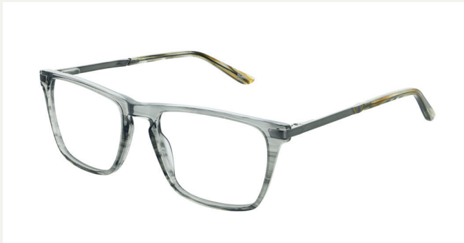
C3. GREEN & BLUE GRADIENT