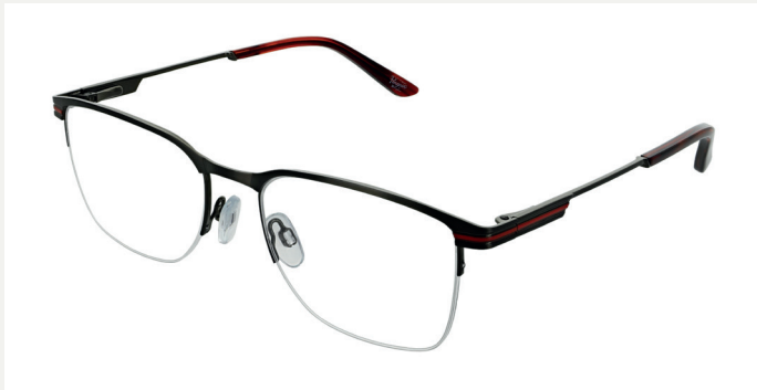
C2. DARK BLUE