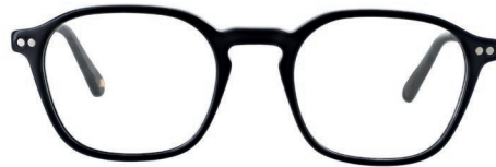
C1 - BLACK WHC0001