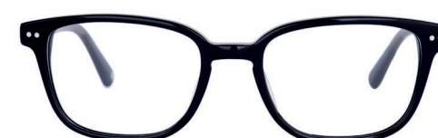
C3 - BLACK & TORT WHBRON3