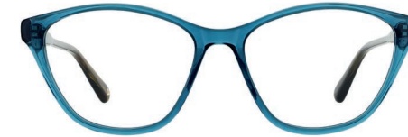
C3 - MIDNIGHT TEAL WHSILO3