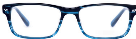
C3 - BLUE WHBYR3