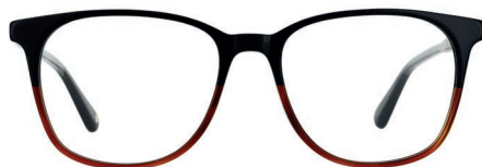
C1 - AUTUMN BLACK WHAYR01