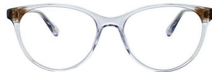
C2 - GREY SMOKE WHANNO2