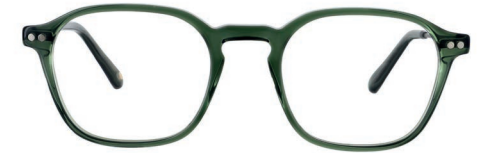
C3 - GREEN WHC0003