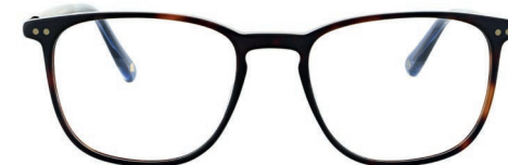
C3 - BURNT EMBER WHDARW03