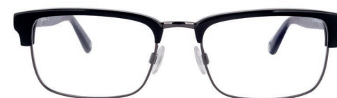
C3 - BLACK WHLOW3