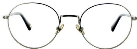
C3 - GOLD & BROWN TORT WHNAS3