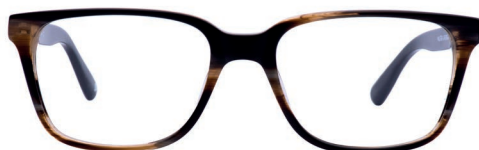
C1 - TORT & BROWN WHDIC1