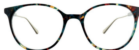
C2 - TURQUOISE TORT WHTEA02