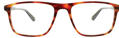
C3 - WALNUT WHMIT02