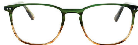
C2 - OLIVE TOPAZ WHDARW03