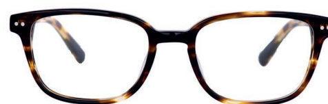
C2 - BROWN TORT WHBRON2