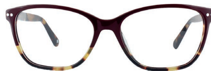
C2 - TORT & RED