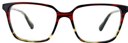
C1 - CRIMSON FLAME WHROS01