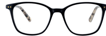
C3 - BLACK WHBELO3