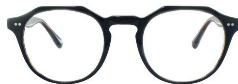
C2 - BLACK & TORT WHHOG2