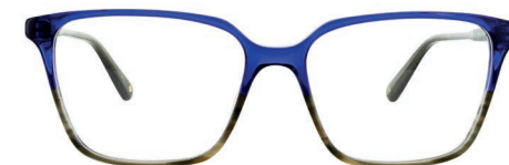
C3 - BERRY BURST WHROS03