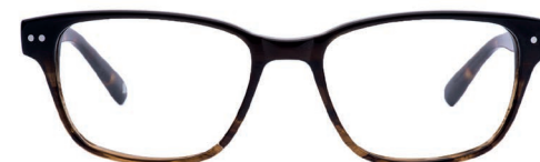
C3 - BROWN WHDUM3