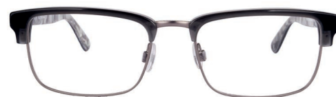
C2 - GREY WHLOW2