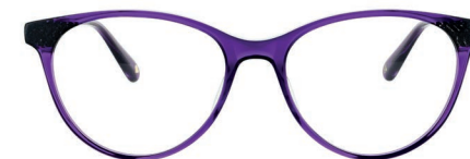
C3 - BERRY BURST WHANNO3