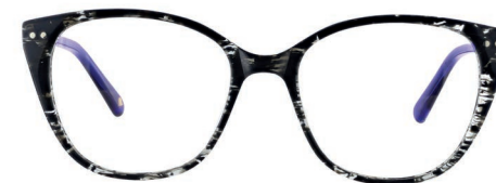
C3 - BLACK WHSIM03