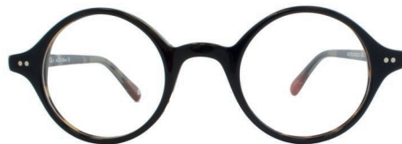
C1 - BLACK & TORT WHCOW1