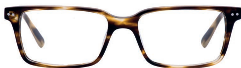
C1 - TORT WHORW1