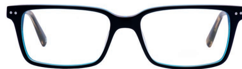
C2 - BLUE & TORT WHORW2