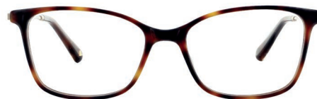
C2 - TORT WHBLA2