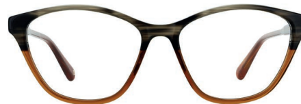
C2 - ROAST CHESTNUT WHSILO2