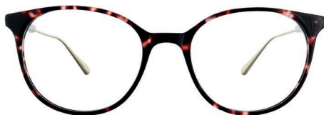
C1 - RUBY TORT WHTEA01