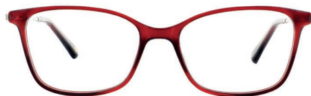
C1 - RED WHBLA1