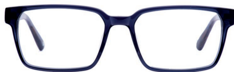
C1 - BLUE WHBRU1