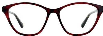
C1 - CRIMSON TORT WHSILO1