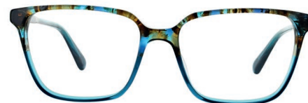
C2 - GREY SMOKE WHROS02