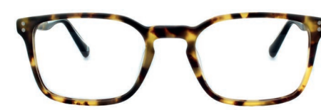
C3 - LIGHT TORT WHLEW3