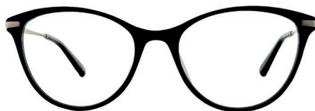
C1 - BLACK WHRUT1