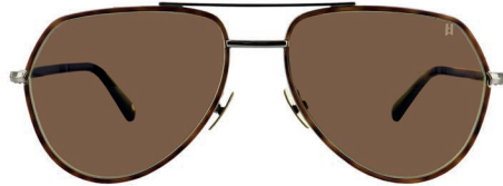
C1 - SEPIA MARBLEWOOD WHSGOLO1