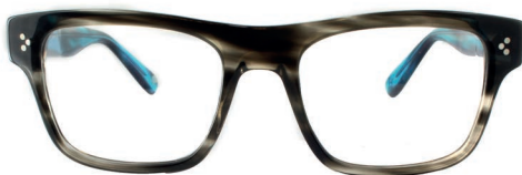
C2 - GREY & BLUE TORT WHSTUB2