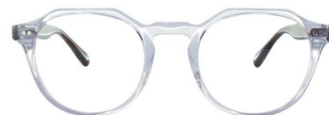
C3 - CRYSTAL & TORT WHHOG3