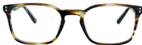
C1 - TORT WHLEW1