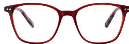
C2 - RED WHBELO2