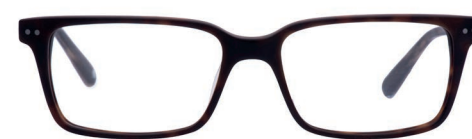
C3 - BROWN WHORW3