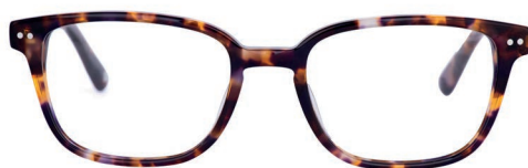
C1 - PURPLE TORT WHBRON1