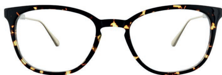
C1 - BROWN TORT WHGLA01