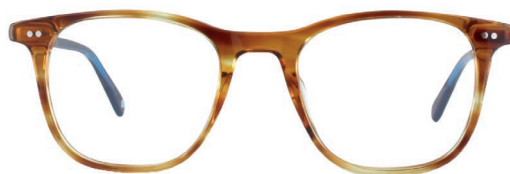
C2 - AMBER TORT & BLUE WHELG2