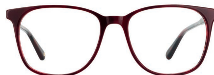
C2 - ENGLISH MULBERRY WHAYR02