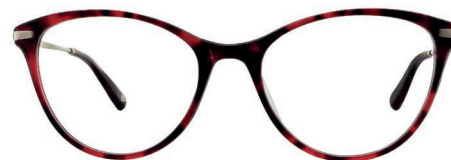
C2 - RED WHRUT2