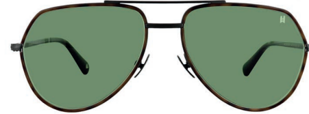
C2 - STORM GREY WHSGOLO2