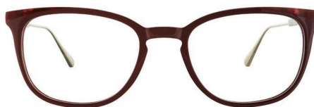
C2 - RED TORT WHGLA02