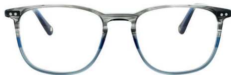
C1 - ARCTIC STORM WHDARW01