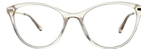
C3 - CRYSTAL WHRUT3