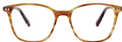
C1 - TORT WHBELO1