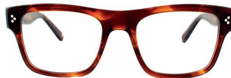
C3 - RED TORT WHSTUB3