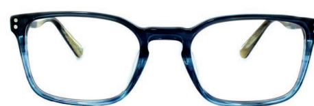
C2 - BLUE WHLEW2