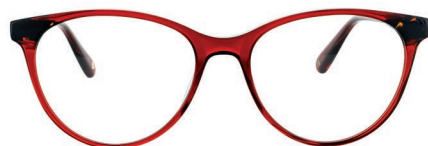
C1 - CRIMSON FLAME WHANNO1