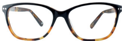
C1 - BLACK & TORT