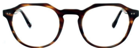
C1 - TORT WHHOG1