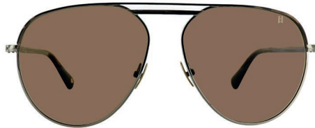
C1 - GOLDEN TORT WHSWALTO1