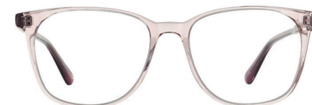
C3 - PINOT BLUSH WHAYR03