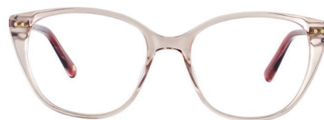
C2 - CRYSTAL & RED WHSIM02