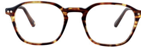
C2 - TORT WHC0002