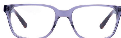
C2 - GREY & TORT WHDIC2