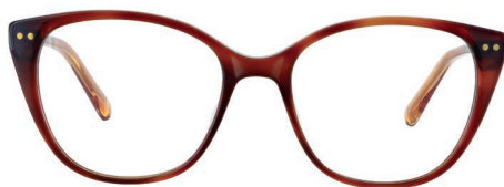
C1 - BROWN WHSIM01