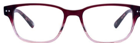
C2 - PINK WHDUM2