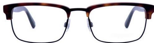
C1 - TORT WHLOW1