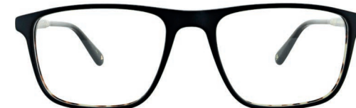
C3 - MIDNIGHT EMBER WHMIT03