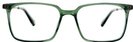
C2 - GREEN & SILVER WHDEF2