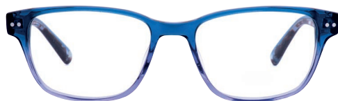
C1 - BLUE WHDUM1