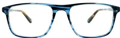
C1 - ARTIC MIDNIGHT WHMIT01