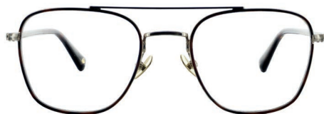
C1 - BROWN TORT & GOLD