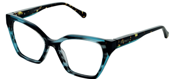
C3 Teal & Blue Stripe