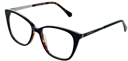
C3 Black & Tort