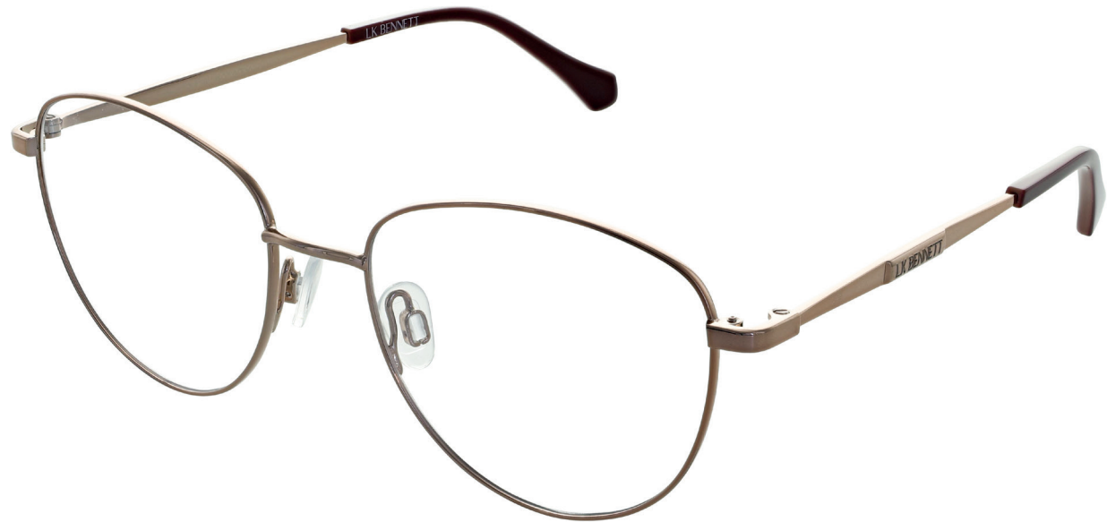
C1 Rose Gold

Eye size: 50mm Bridge: 17mm Temple: 140mm