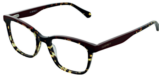
C2 Red Tort