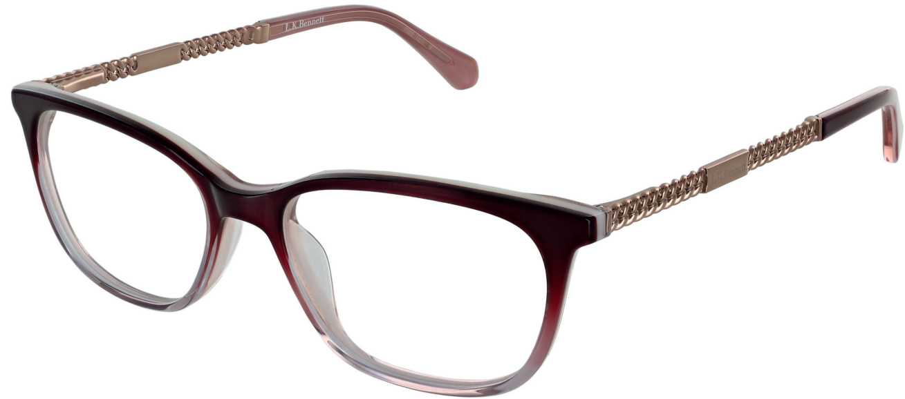
C2 Burgundy & Gold

Eye size: 50mm Bridge: 16mm Temple: 140mm