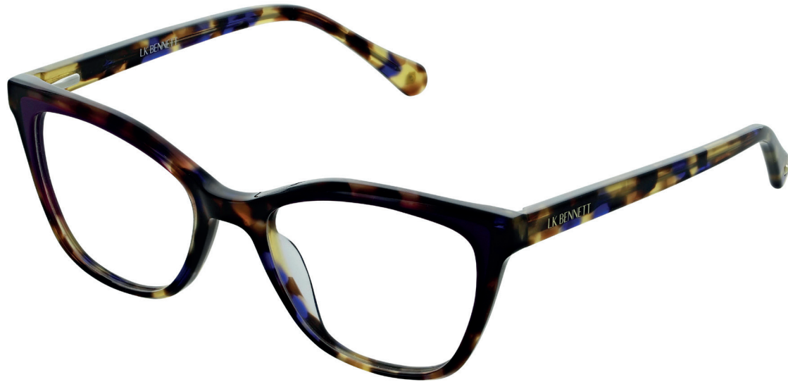
C1 Purple & Tort

Eye size: 49mm Bridge: 17mm Temple: 135mm