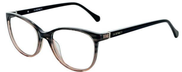
C3 Grey & Pink Gradient