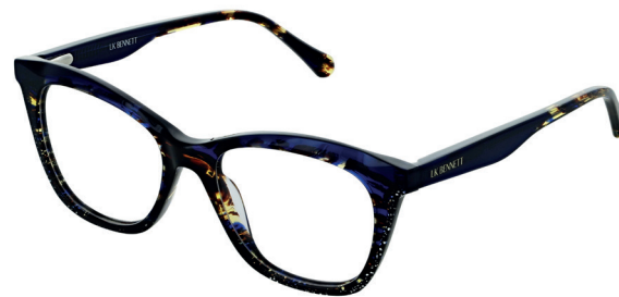
C2 Blue & Blue Tort