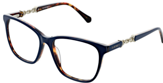
C2 Rose Gold