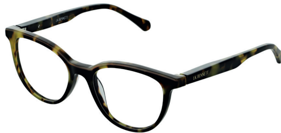
C2 Cream & Tort