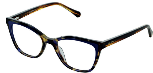
C3 Blue Tort