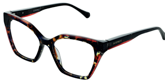
C2 Pink & Blue Tort