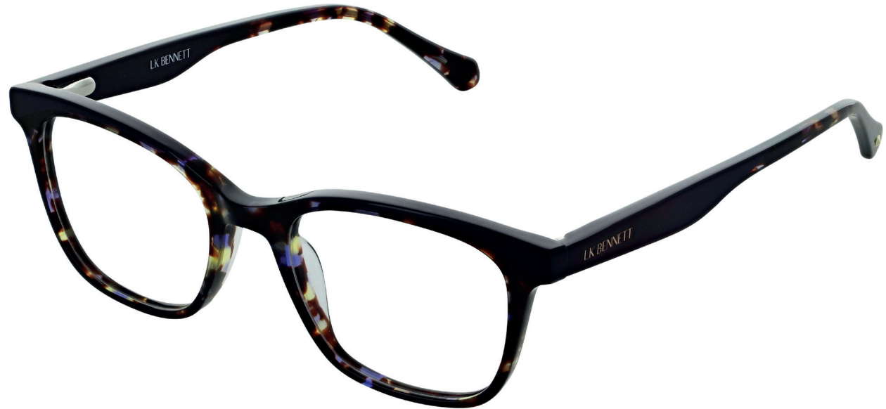
C1 Purple & Purple Tort

Eye size: 49mm Bridge: 18mm Temple: 140mm