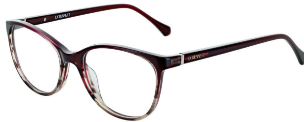
C2 Burgundy Gradient