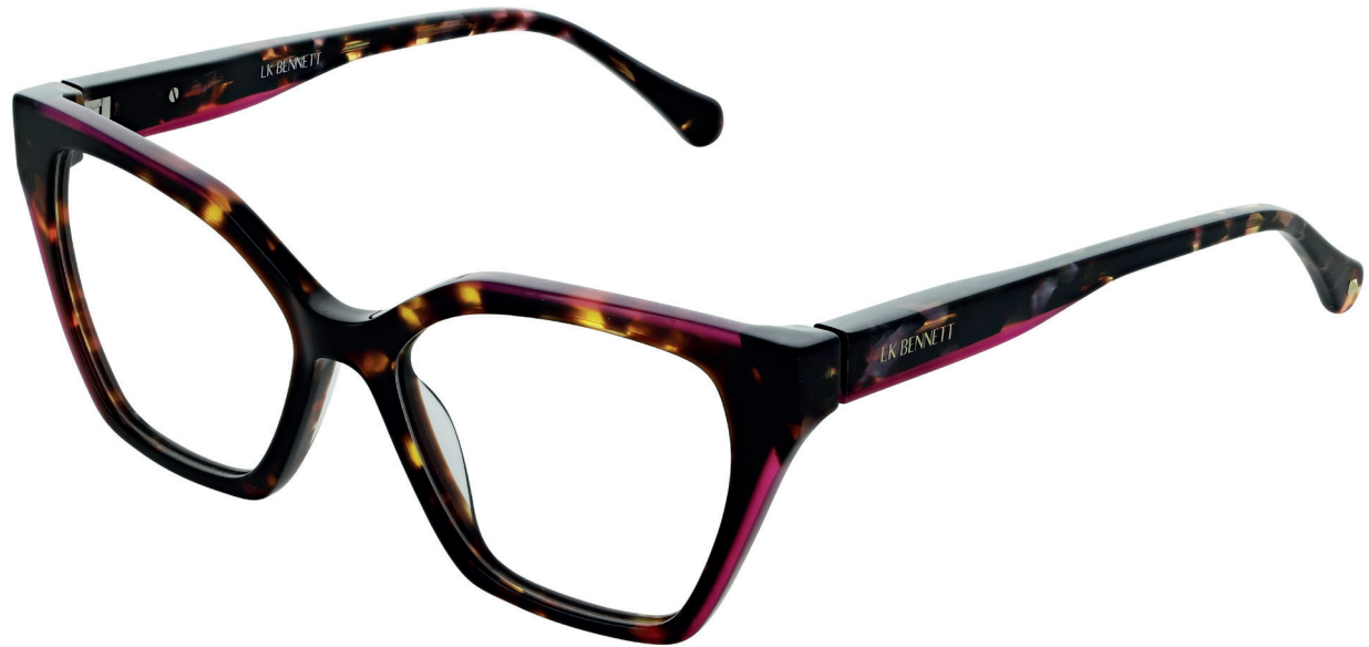
C1 Purple & Tort

Eye size: 52mm Bridge: 16mm Temple: 140mm