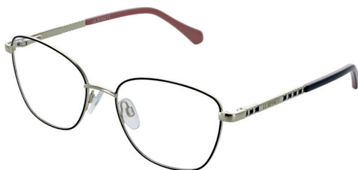
C2 Rose Gold