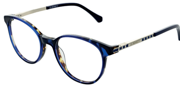
C2 Blue Tort