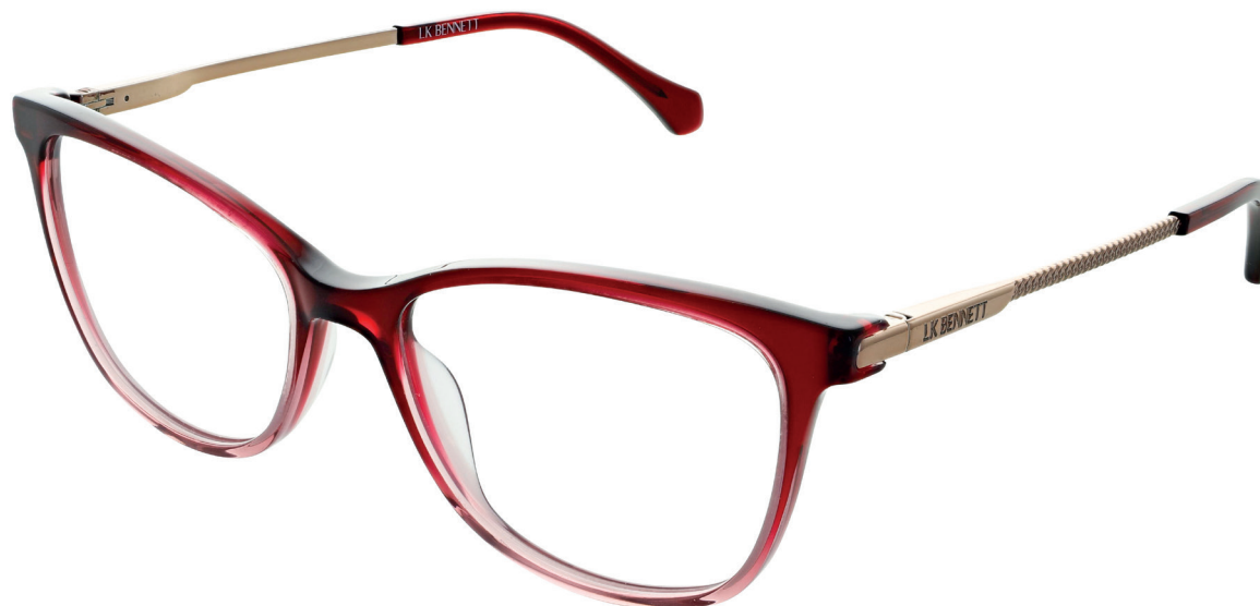
C1 Red Gradient