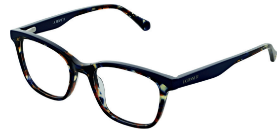
C3 Blue Tort