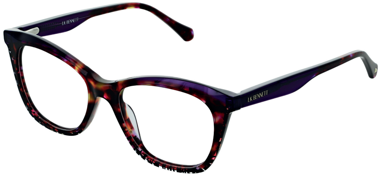
C1 Purple & Tort

Eye size: 51mm Bridge: 17mm Temple: 140mm