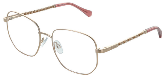
C2 Rose Gold