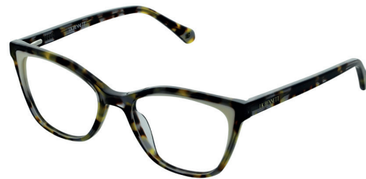
C2 Cream & Tort