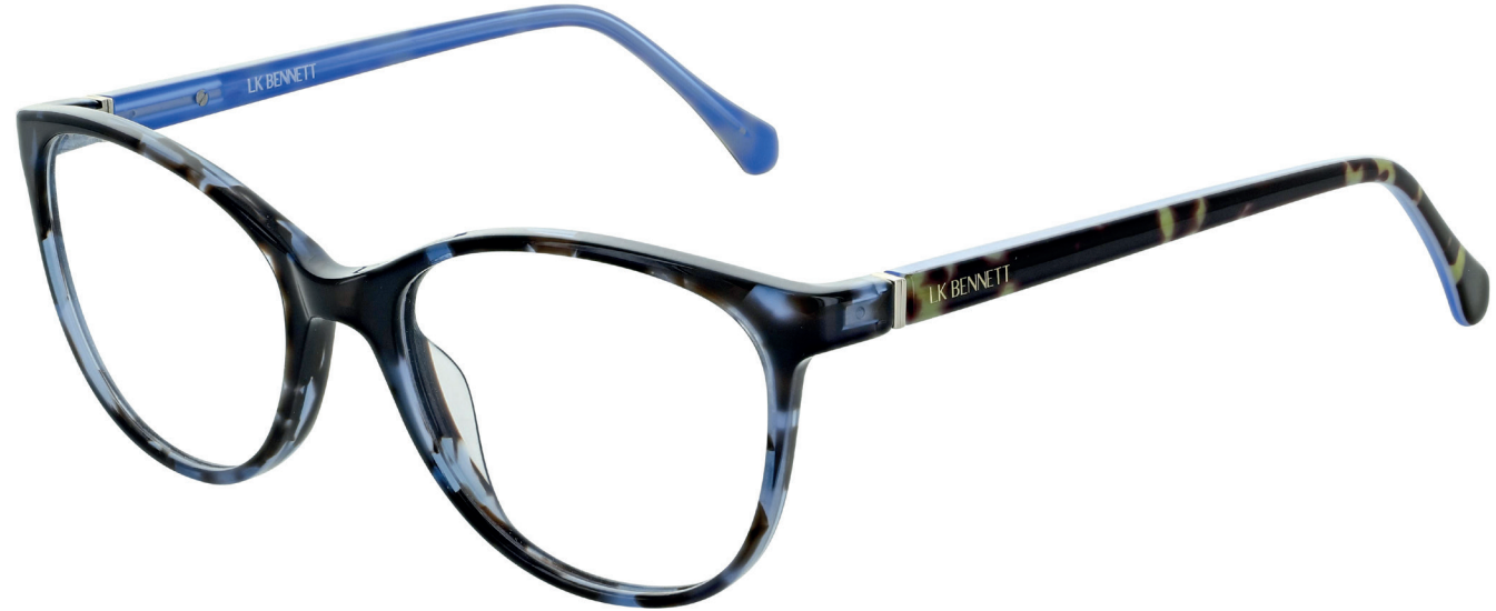
C1 Blue Tort

Eye size: 51mm Bridge: 17mm Temple: 140mm