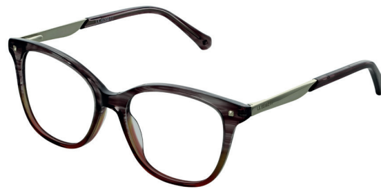
C2 Gradient Amber