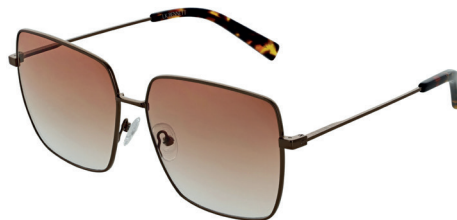
C2 Rose Gold