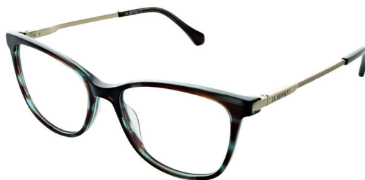
C3 Blue Stripe