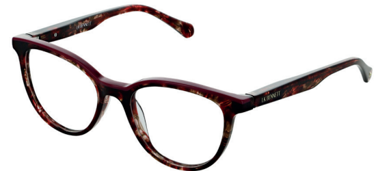
C3 Pink & Red Tort