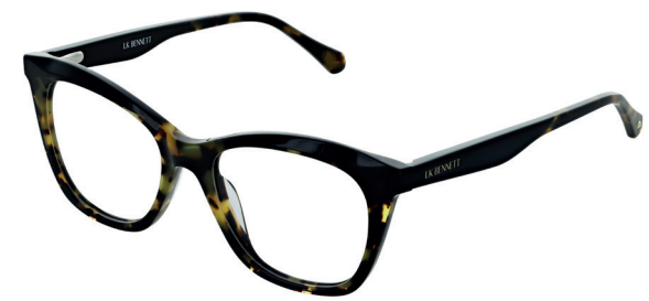
C3 Black Tort