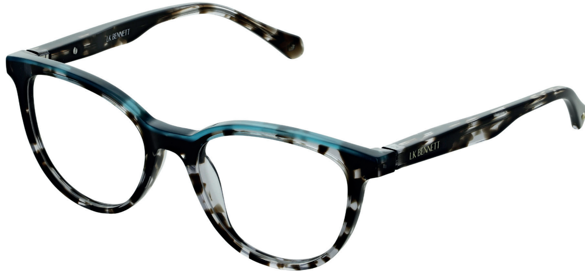
C1 Teal & Grey Tort

Eye size: 49mm Bridge: 17mm Temple: 135mm