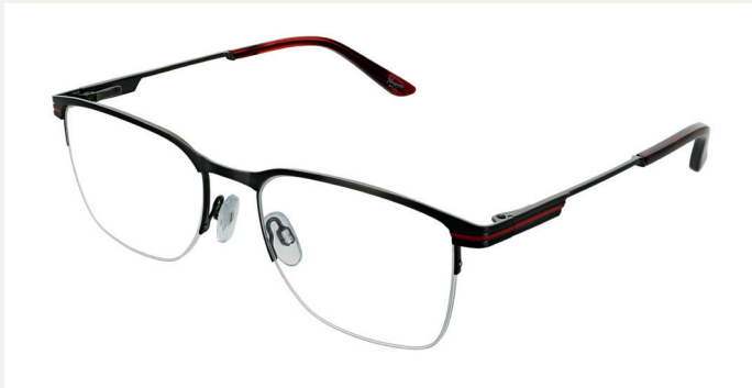
C1. DARK GUN