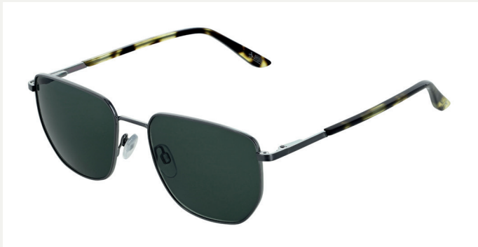
C1. LIGHT GUN