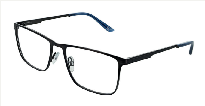
C1. DARK GUN