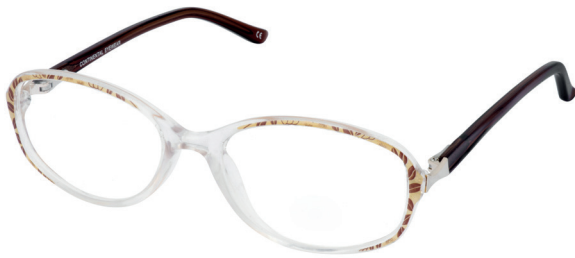
Brown & Crystal