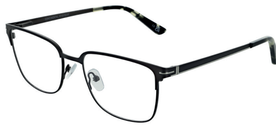
Gun & Silver