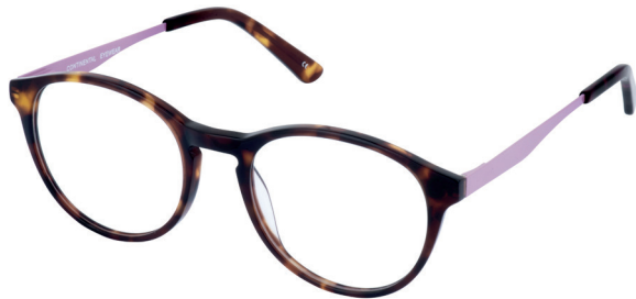
Brown & Lilac