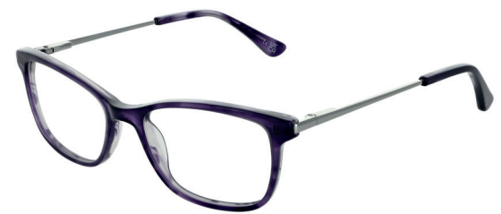
Lilac & Silver