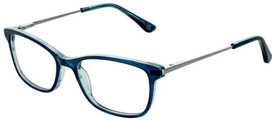
Blue & Silver