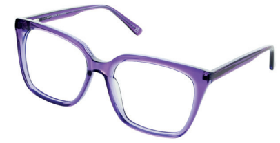
Crystal Purple Rose