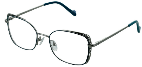
Silver & Teal