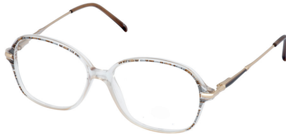
Granite & Crystal