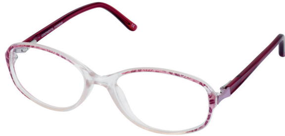
Pink & Crystal