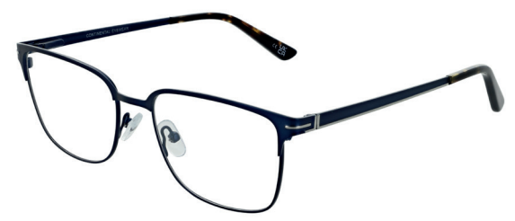
Navy & Silver