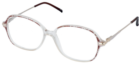
Brown & Crystal