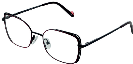
Black & Pink