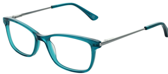
Crystal Green & Gun