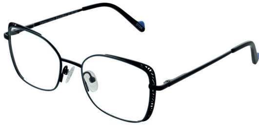
Black & Blue