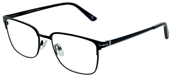
Black & Silver