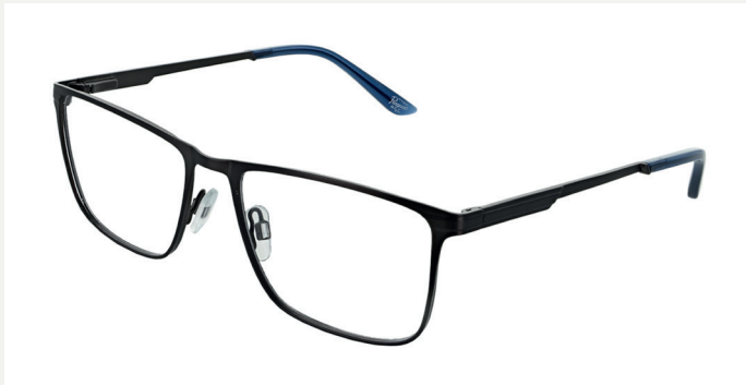
C1. DARK GUN