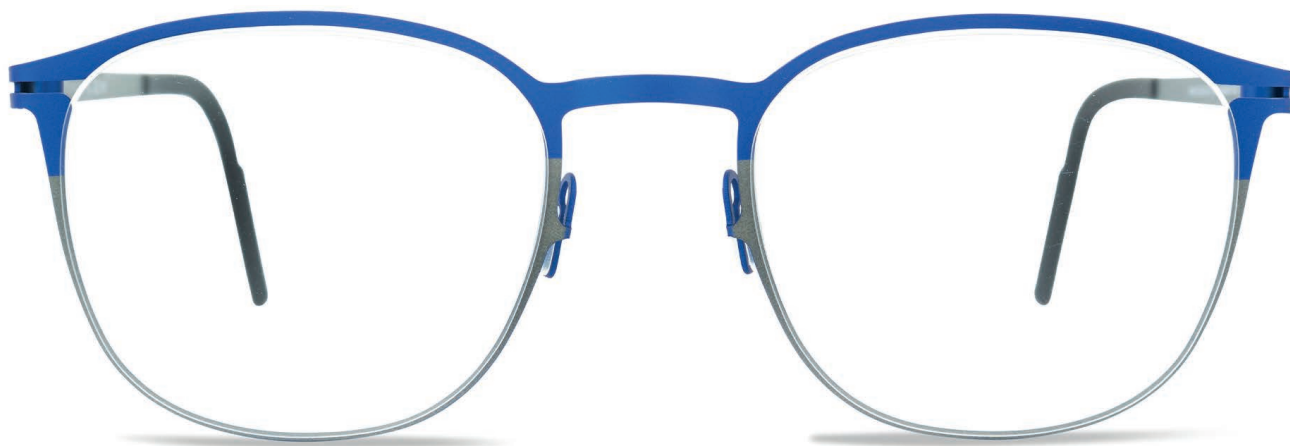
NEW - NAVY & GUN

Its spherical rims paired with its two-toned colourway, make it a frame that is not to be missed!