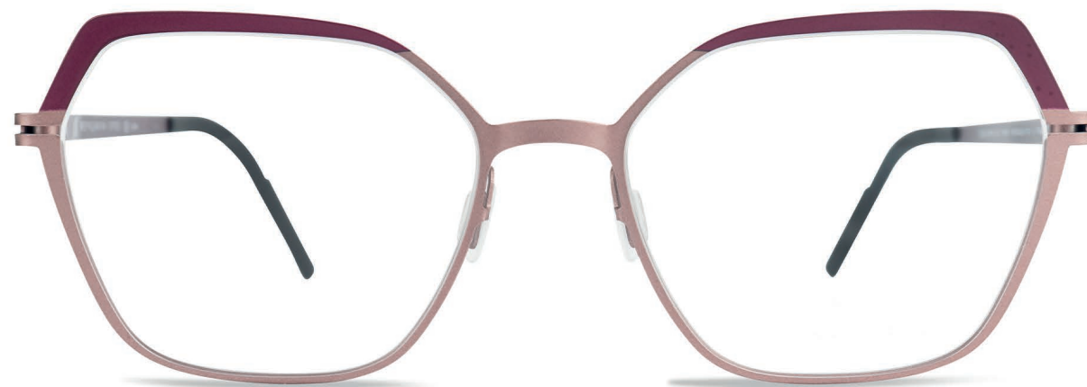
NEW - BURGUNDY & TAUPE