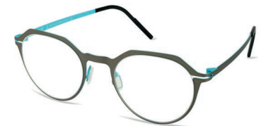
GUN & BLUE