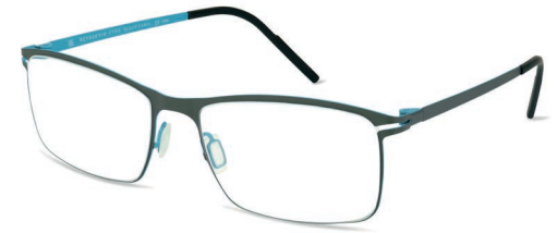
GUN & BLUE