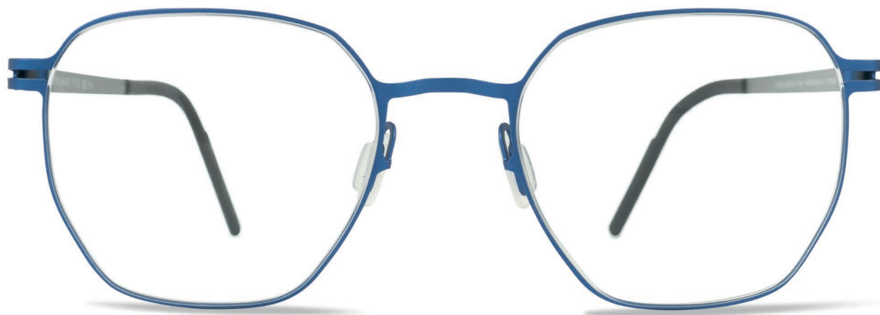
NEW - NAVY & GUN

With minimalistic design, and on trend colours, this is a highly wearable stylish frame.