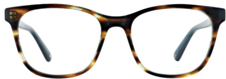
C2 - TORT WHPAR2