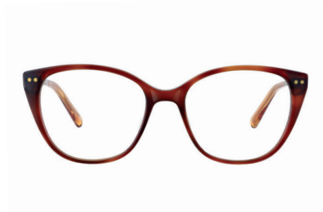
C1 - BROWN WHSIM01