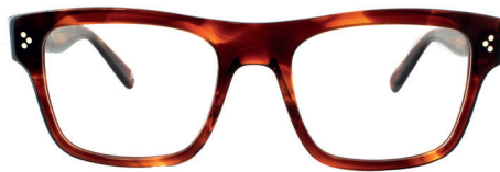
C3 - RED TORT WHSTUB3