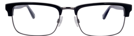
C3 - BLACK WHLOW3