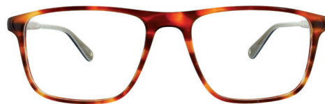
C2 - WALNUT WHMIT02