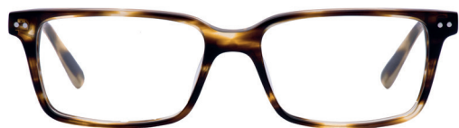
C1 - TORT WHORW1