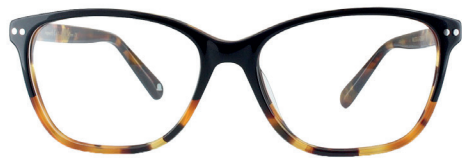
C1 - BLACK & TORT WHHEPW1