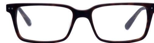
C3 - BROWN WHORW3