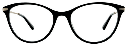
C1 - BLACK WHRUT1