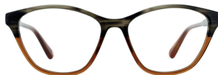
C2 - ROAST CHESTNUT WHSILO2