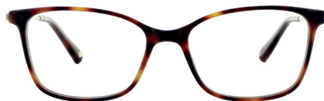
C2 - TORT WHBLA2