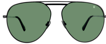
C2 - STORM GREY TORT WHWALTO2