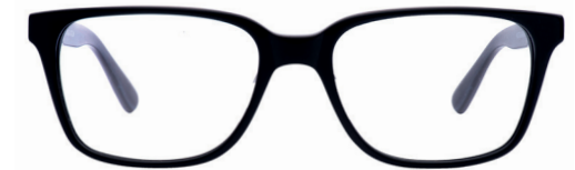
C3 - BLACK & GREY WHDIC3