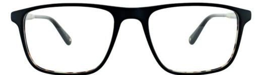
C3 - MIDNIGHT EMBER WHMIT03