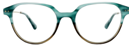
C3 - GREEN & BROWN WHDAV3