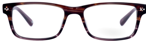
C2 - BROWN WHKIP2