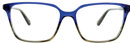
C3 - BERRY BURST WHROS03