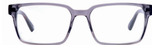
C2 - TORT WHC0002