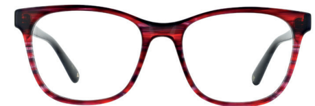
C4 - RED WHPAR4