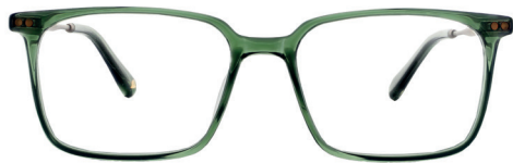
C2 - GREEN & SILVER WHDEF2