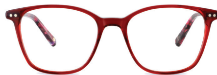
C2 - RED WHBELO2