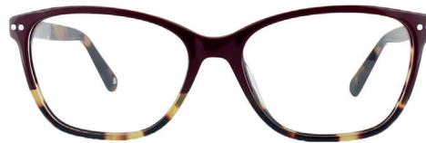
C2 - TORT & RED WHHEPW2