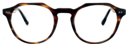
C1 - TORT WHHOG1