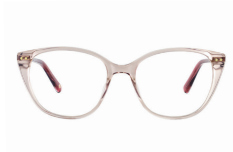
C2 - CRYSTAL & RED WHSIM02