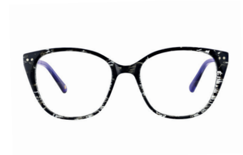
C3 - BLACK WHSIM03