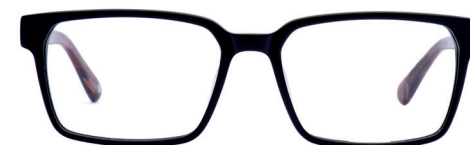
C3 - GREEN WHC0003