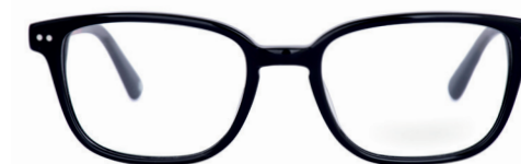
C3 - BLACK & TORT WHBRON3