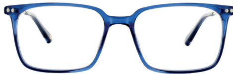
C3 - BLUE & SILVER WHDEF3