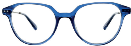
C2 - BLUE WHDAV2