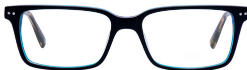
C2 - BLUE & TORT WHORW2