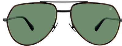
C2 - STORM GREY WHGOLO2