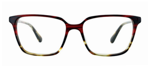
C1 - CRIMSON FLAME WHROS01