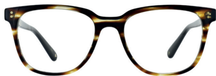
C4 - TORT WHCHA01