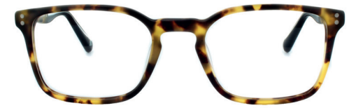
C3 - LIGHT TORT WHLEW3