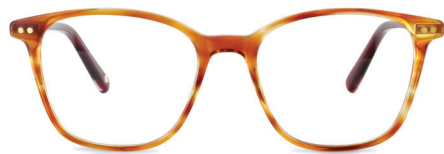
C1 - TORT WHBELO1