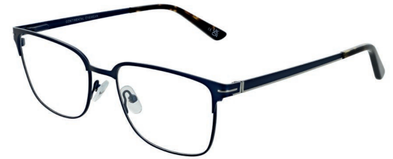
Navy & Silver