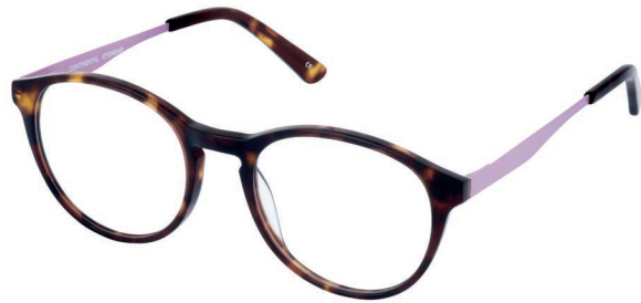
Brown & Lilac