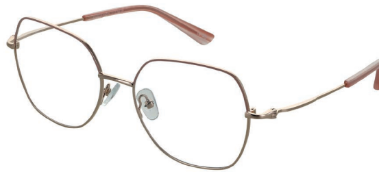
Rose Gold & Pink