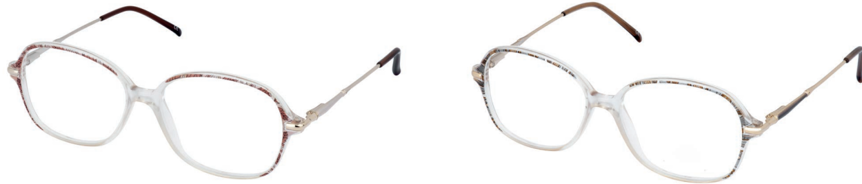
Brown & Crystal