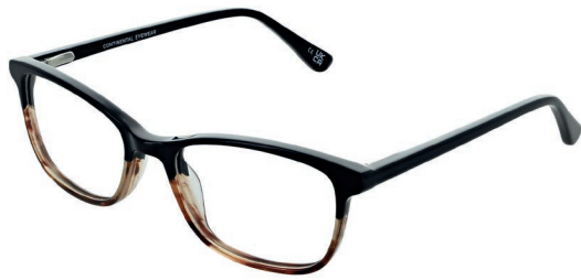
Black & Tort