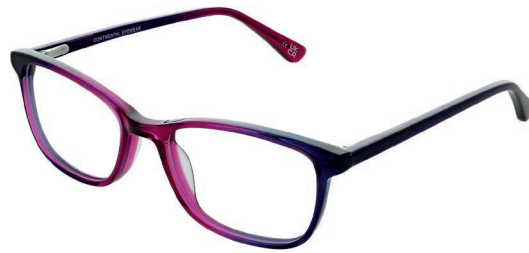
Pink & Purple