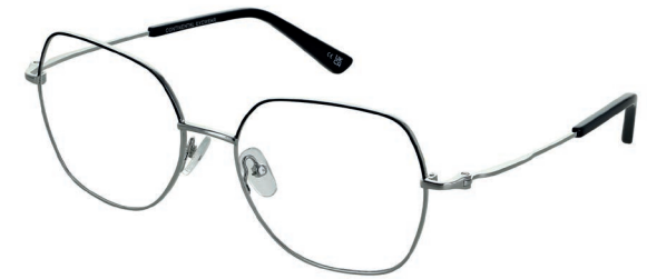
Silver & Black