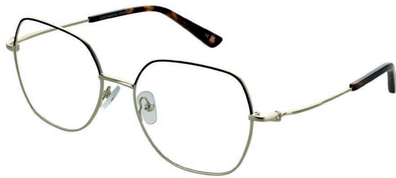
Gold & Black