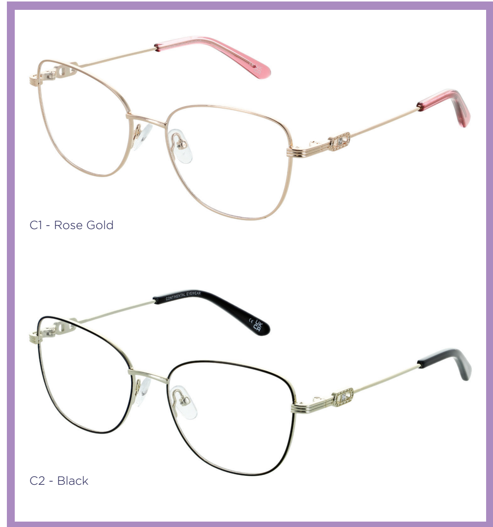
C1 - Rose Gold