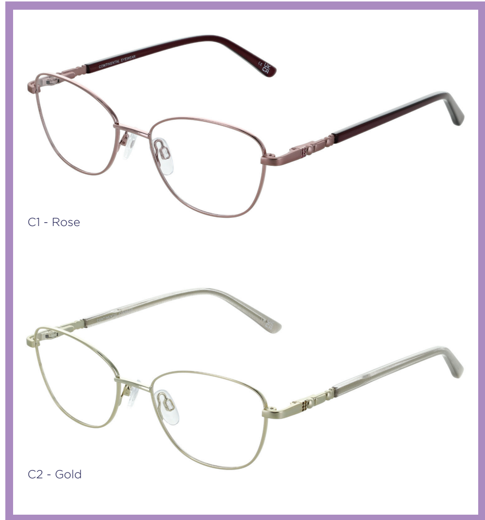
C1 - Rose