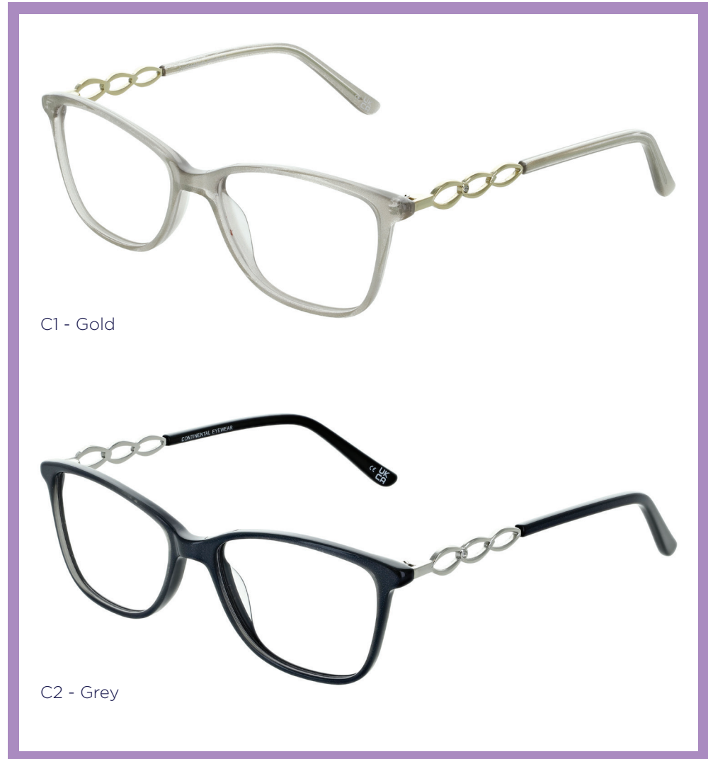
C1 - Gold