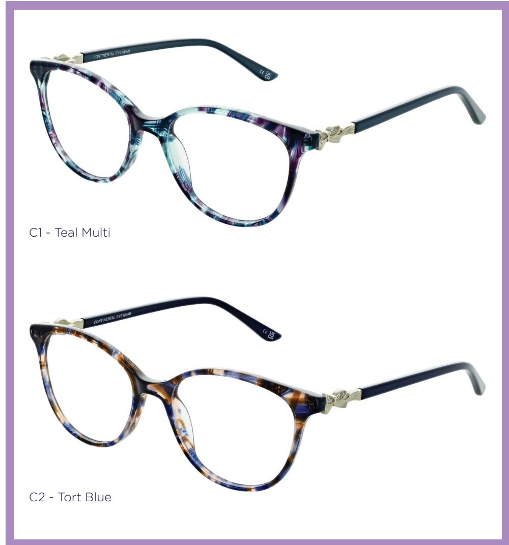
C1 - Teal Multi