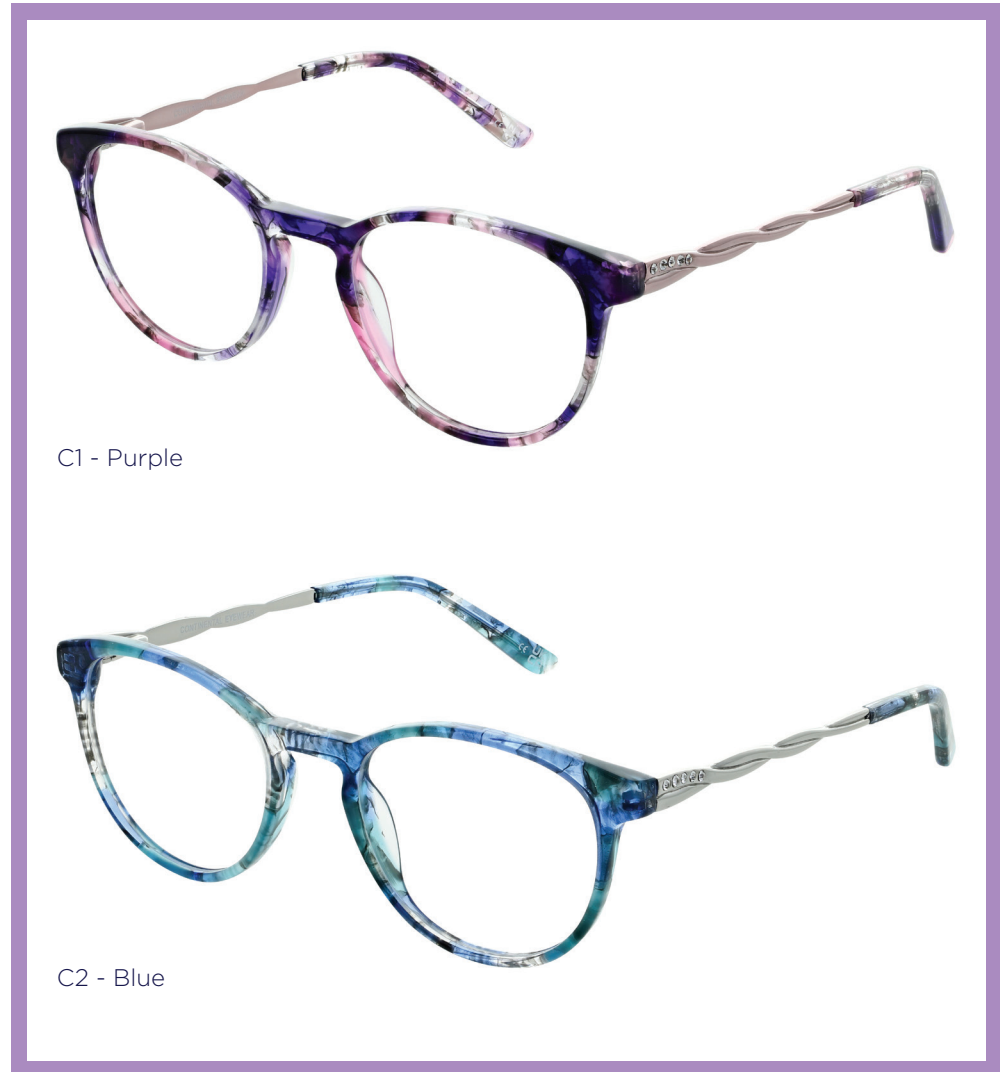
C1 - Purple