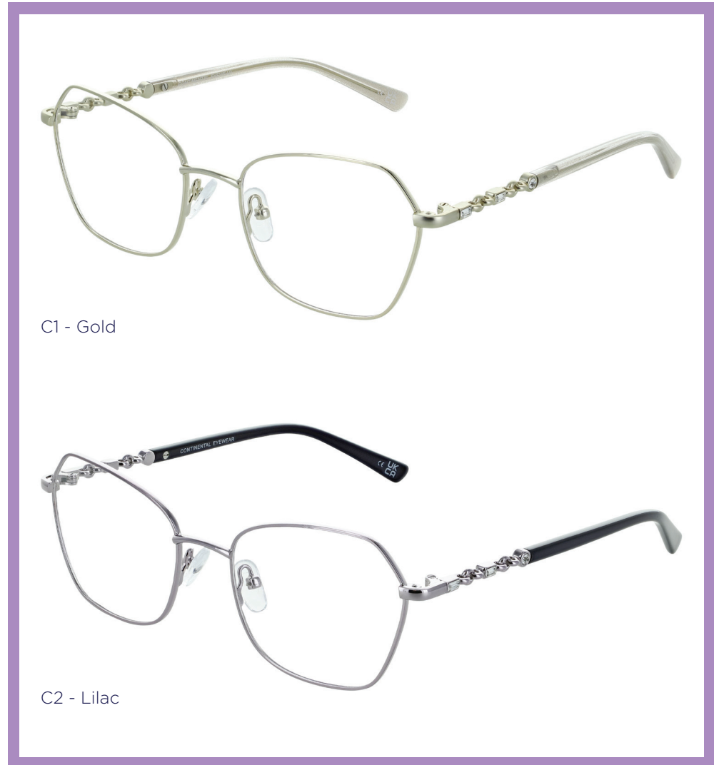
C1 - Gold