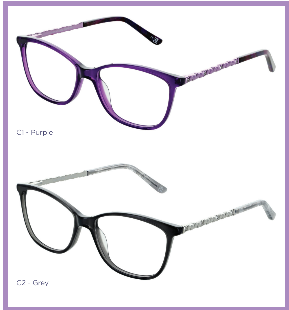
C1 - Purple