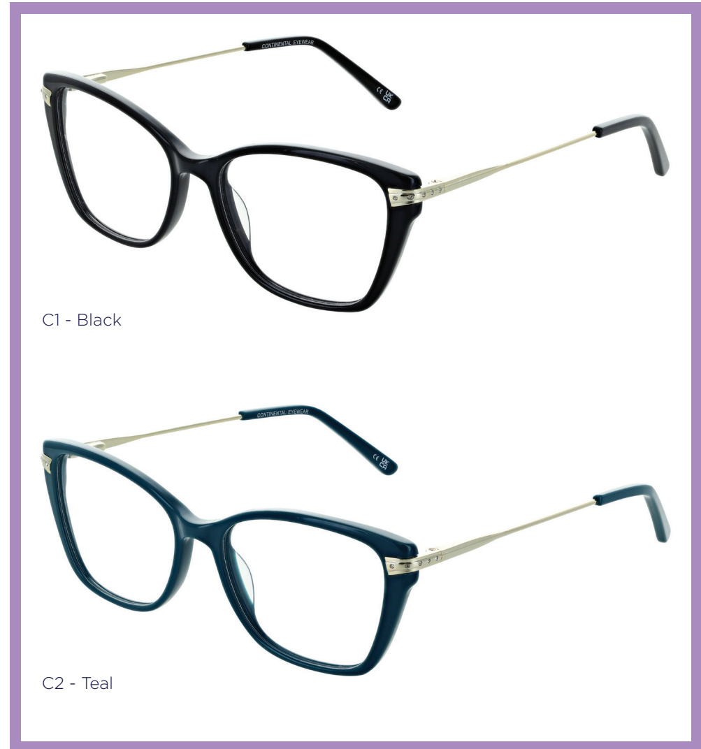
C1 - Black