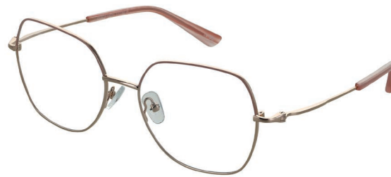
Rose Gold & Pink